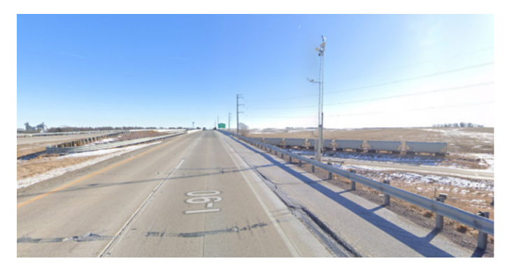
Image 3: Aurora Website – Non-Invasive Sensor Deployment in Aurora Member States

The contents of this document reflect the views of the authors, who are responsible for the facts and accuracy of the data presented herein. The contents do not necessarily reflect the official views or policies of the California Department of Transportation, the State of California, or the Federal Highway Administration. This document does not constitute a standard, specification, or regulation. No part of this publication should be construed as an endorsement for a commercial product, manufacturer, contractor, or consultant. Any trade names or photos of commercial products appearing in this document are for clarity only.