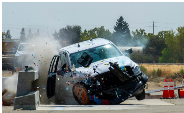
Image 6: 2270P (pickup) test on Type 86H Concrete Barrier Rail Looking South