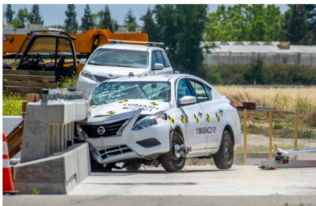
Image 5: 1100C (Passenger Car) test on Type 86H Concrete Barrier Rail Looking South