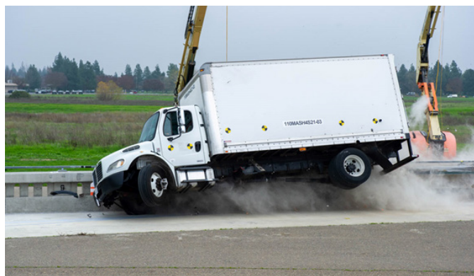
Image 7: 10000S (Single-Unit Truck) test on Type 86H Concrete Barrier Rail Looking East

The contents of this document reflect the views of the authors, who are responsible for the facts and accuracy of the data presented herein. The contents do not necessarily reflect the official views or policies of the California Department of Transportation, the State of California, or the Federal Highway Administration. This document does not constitute a standard, specification, or regulation. No part of this publication should be construed as an endorsement for a commercial product, manufacturer, contractor, or consultant. Any trade names or photos of commercial products appearing in this document are for clarity only.