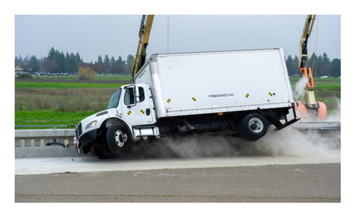
Image 7: 10000S (Single-Unit Truck) test on Type 86H Concrete Barrier Rail Looking East