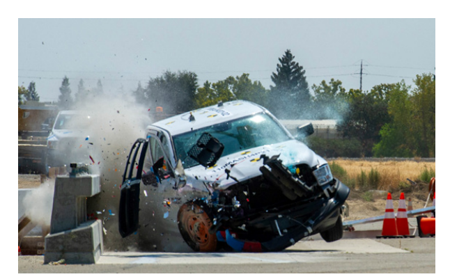
Image 6: 2270P (pickup) test on Type 86H Concrete Barrier Rail Looking South