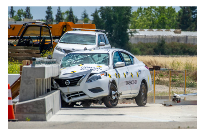
Image 5: 1100C (Passenger Car) test on Type 86H Concrete Barrier Rail Looking South

Image 4: Type 86H Concrete Barrier looking North