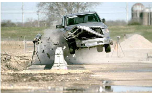
Image 3: Test 616811-01-3 Asphalt Median Configuration 2023_01_19