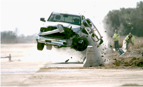
Image 1: Test 616811-01-1 Asphalt Roadside Configuration 2023_01_13