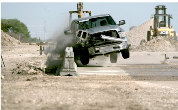
Image 2: Test 616811-01-2 PCC Bolted Roadside Configuration 2023_03_13