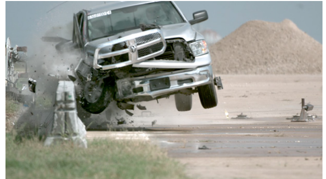
Image 4: Test 616811-01-4 PCC Bolted Median Configuration with 5 inch embedment 2023_09_29