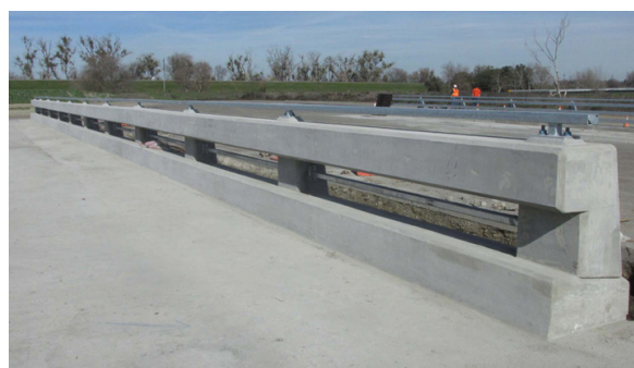
Image 2: Completed Type 85 Bridge Rail at the Caltrans Dynamic Test Facility