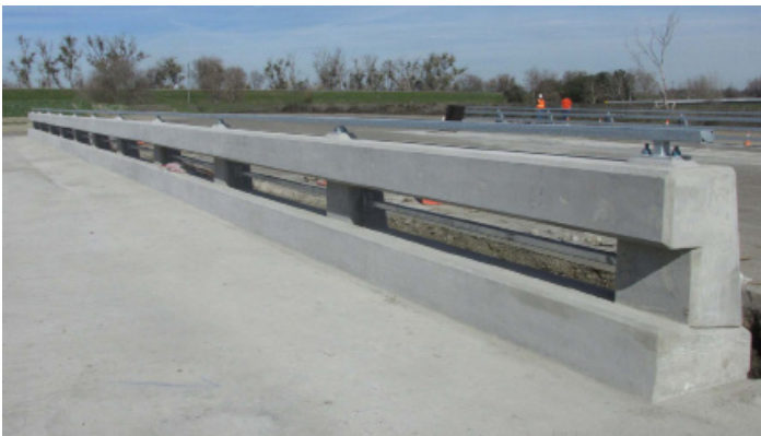
Image 2: Completed Type 85 Bridge Rail at the Caltrans Dynamic Test Facility