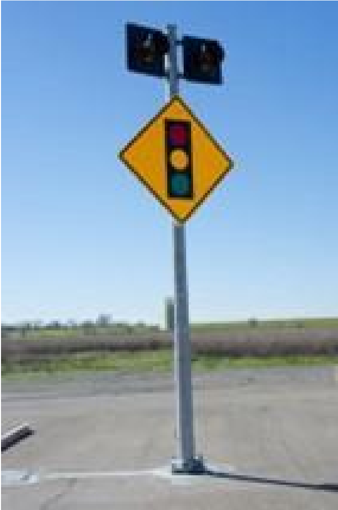
Image 1: Modified Type 15-FBS at the Caltrans Dynamic Test Facility