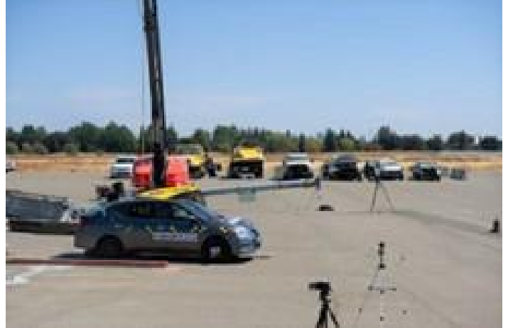
Image 6: TEST 410MASH3C22-01 Small Car 19 MPH Impact (September 14, 2022)