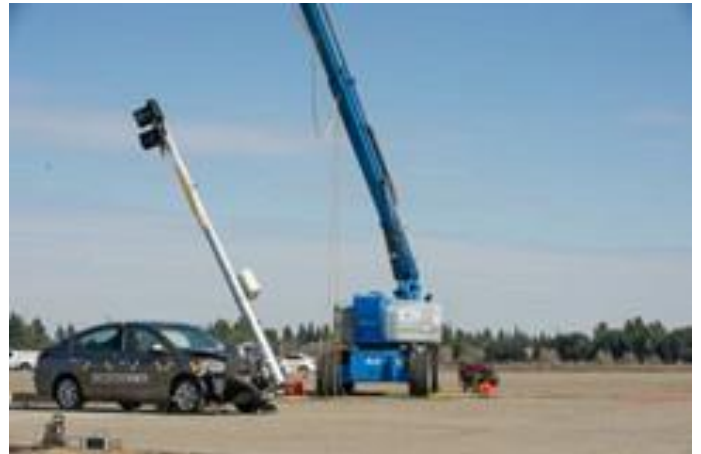
Image 3: Test 430MASH3C17-01 Small Car 31 MPH Impact (March 7, 2018)