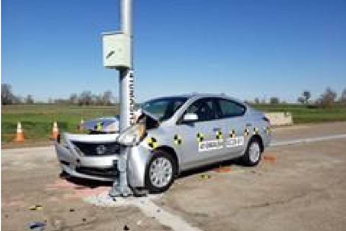
Image 4: TEST 410MASH3C20-01 Small Car 19 MPH Impact (February 26, 2020)