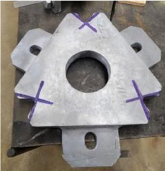
Image 5: TYPE 15-FBS SLIPBASE MODIFICATIONS – INCREASE NOTCH ANGLE FROM 60° TO 90°