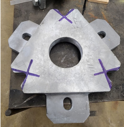
Image 5: TYPE 15-FBS SLIPBASE MODIFICATIONS – INCREASE NOTCH ANGLE FROM 60° TO 90°