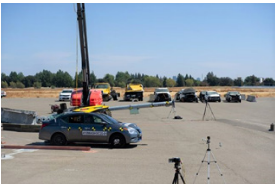
Image 6: TEST 410MASH3C22-01 Small Car 19 MPH Impact (September 14, 2022)