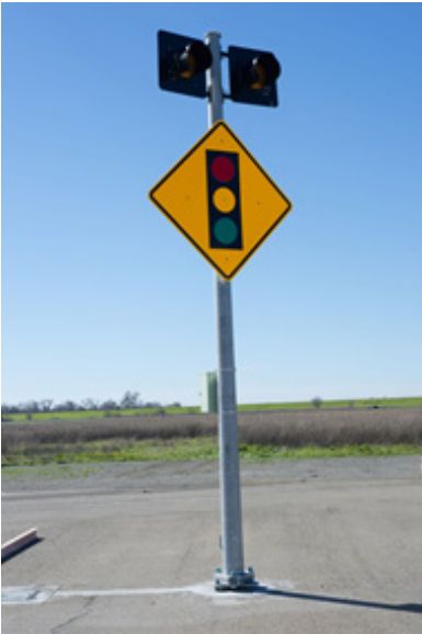
Image 1: Modified Type 15-FBS at the Caltrans Dynamic Test Facility