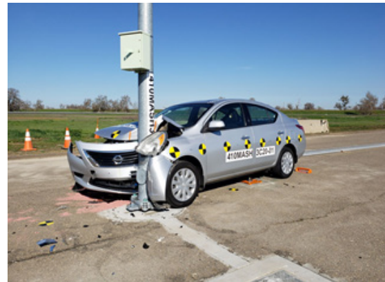
Image 4: TEST 410MASH3C20-01 Small Car 19 MPH Impact (February 26, 2020)

The contents of this document reflect the views of the authors, who are responsible for the facts and accuracy of the data presented herein. The contents do not necessarily reflect the official views or policies of the California Department of Transportation, the State of California, or the Federal Highway Administration. This document does not constitute a standard, specification, or regulation. No part of this publication should be construed as an endorsement for a commercial product, manufacturer, contractor, or consultant. Any trade names or photos of commercial products appearing in this document are for clarity only.