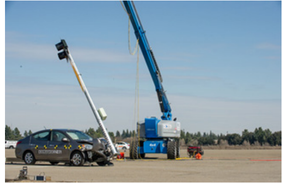
Image 3: Test 430MASH3C17-01 Small Car 31 MPH Impact (March 7, 2018)