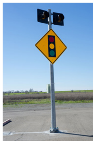
Image 1: Modified Type 15-FBS at the Caltrans Dynamic Test Facility