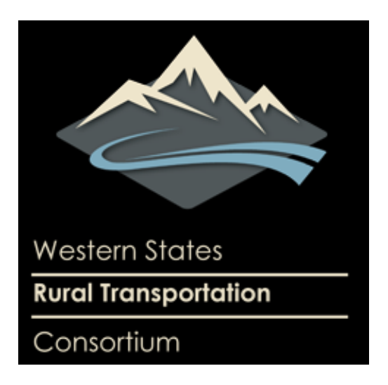
Image 1: Logo for the Western States Rural Transportation Consortium