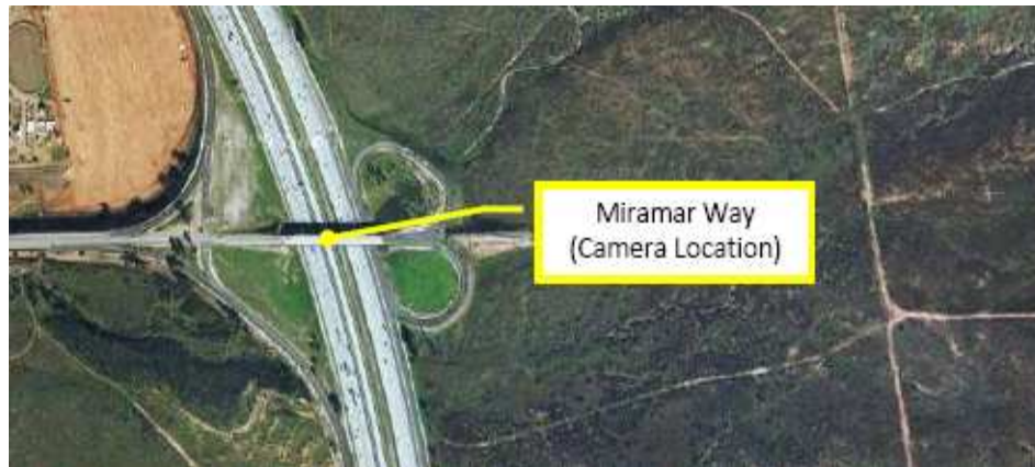
Figure 4 Miramar Test Location

Miramar Way of the Interstate I-15 is chosen as the testing site. See Figures 3 and 4. The I-15 Managed Lanes (ML) in San Diego, California is an expansion of existing high-occupancy toll (HOT) lanes known as the Express Lanes. The existing two-lane reversible Express Lanes facility had single entry and exit points at each end of an eight mile segment with a toll zone at the southern end. The new Managed Lanes will have four bi-directional lanes extending twenty miles in length and containing multiple intermediate access locations. The Miramar test location is at the southern side of the I-15 Managed Lane facility. This particular location has a two lane configuration that alternates directional flow based on a morning/afternoon schedule. The lanes are configured southbound during the morning peak and northbound during afternoon peak.