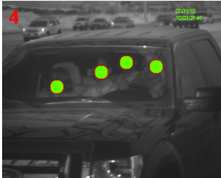
Figure 2 detect Image Sample