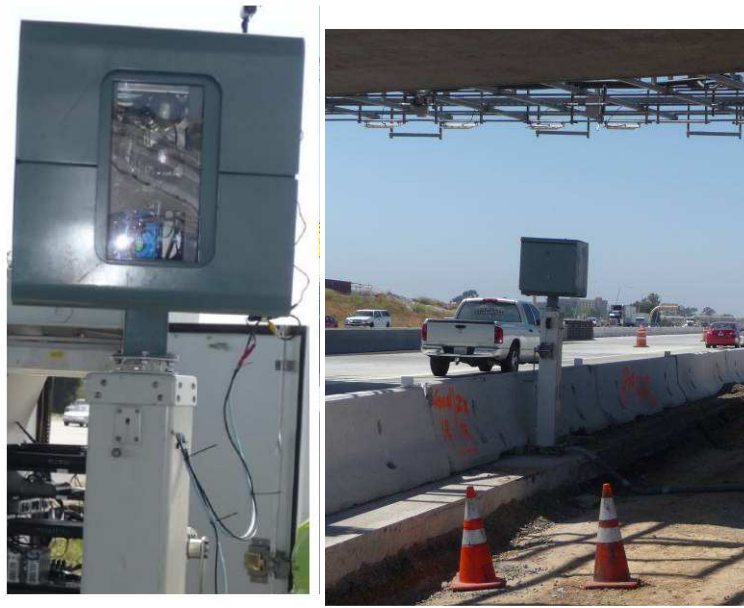
Figure 6 dtect System Roadside Installation