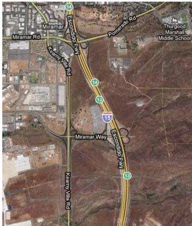
Figure 3 Test Site Vicinity Map