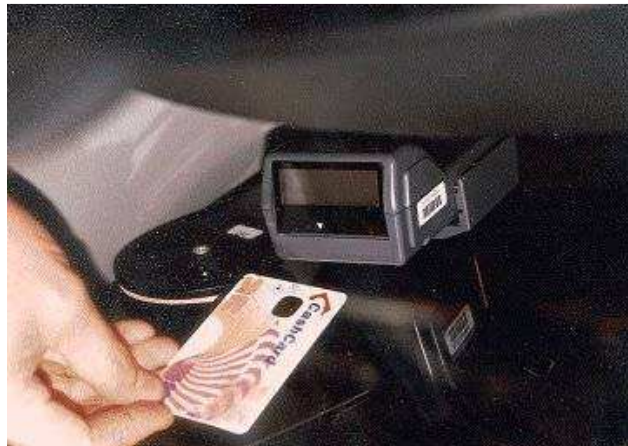
Figure 12 Smart Card OBU for the Electronic Road Pricing Scheme in Singapore 9

Figure 11 shows the transponders that are selected for Utah's I-15 Express Lanes - the photo on the right shows a transponder in the SOV status (on) and the photo on the left shows the transponder on HOV status (off) 8 .