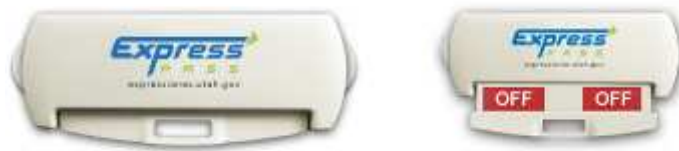
Figure 11 Switchable Transponders

Switchable transponders allow drivers to declare their vehicle occupancy status as either SOV or HOV by toggling a switching mechanism on the unit. Depending on the type of transponder, a user could conceivably declare different levels of occupancy. This type of transponder is also known as a “hard-switch” transponder. With “soft-switch” transponders customers would be able to change their status by calling a service center prior to their trip while the transponder itself does not have a physical mechanism to change to a desired occupancy status. Several HOT lanes projects are planning on adopting switchable transponders in their facilities. Examples include the I-15 Express Lanes in Utah (Section 6.3) and the I-395/Capitol Beltway HOT lanes (Section 6.7).