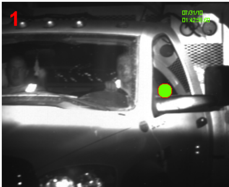
Figure 9 A Default Case for the dtect Camera

The initial review of logged images reveals a notable default behavior of the dtect system as shown in Figure 9. In many cases, the dtect system could not find any human facial features in the captured images, which by design prompted the system to provide a default output of one occupant and to place a green blob at a fixed location in the middle of the right-hand side of the image even if there is no occupant detected.