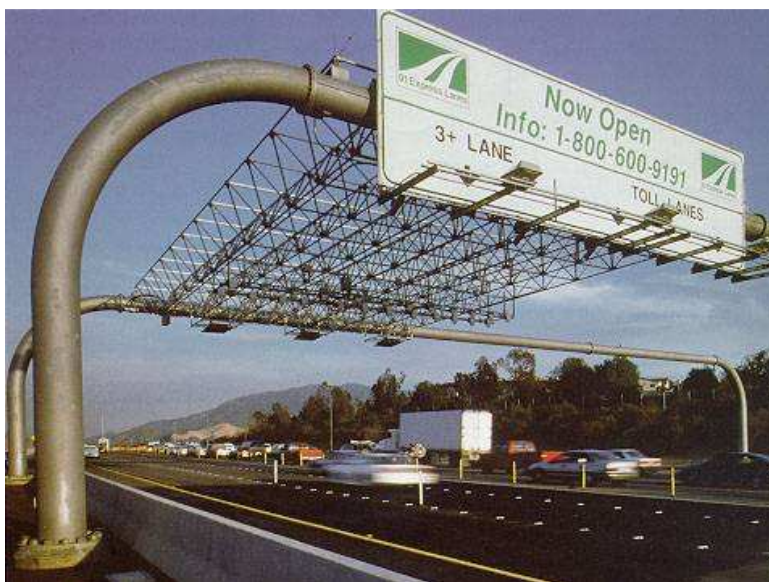
Figure 13 Self-Declaration Lanes for the SR-91 Express Lanes in Orange County 10

In facilities with self-declaration lanes, users declare their occupancy status by driving through the designated HOV or SOV lanes at the tolling locations. Vehicles on the SOV lanes must be fitted with a transponder to pay the toll while vehicles using the HOV lane must have the required number of occupants to avoid being stopped by the highway patrol. Prior to the tolling point, users are free to drive in any lane. This type of configuration is used in Denver's I-15 HOV Express Lanes (Section 6.5) and is planned for the METRO HOT lanes project in Houston, Texas (Section 6.6).