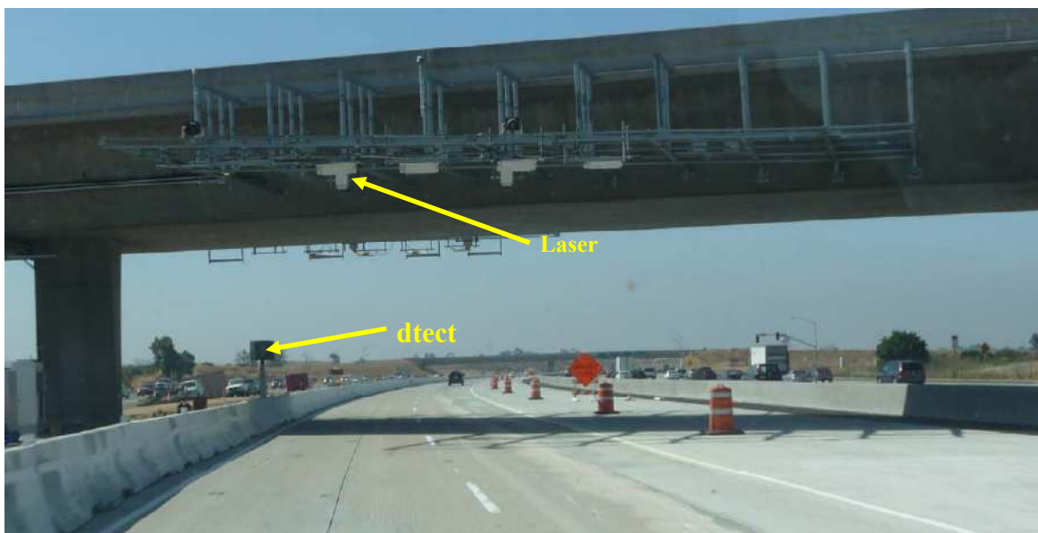
Figure 5 dteck camera position