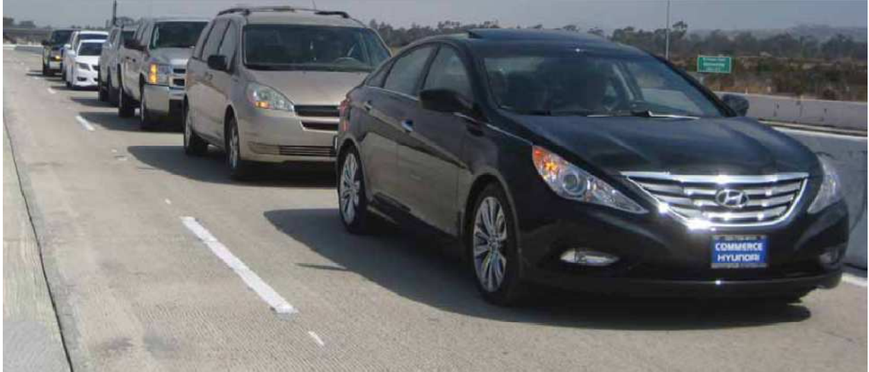
Figure 8 Test Platoon at Starting Location

Controlled tests were conducted on evenings and nights of July 30, 2010 and July 31, 2010, and during daytime of July 31, 2010. For each controlled test run, control variables and their values (Table 1) such as vehicle type, speed, seating assignment and body type are predetermined and recorded. The detailed test case descriptions can be found in Appendix III.