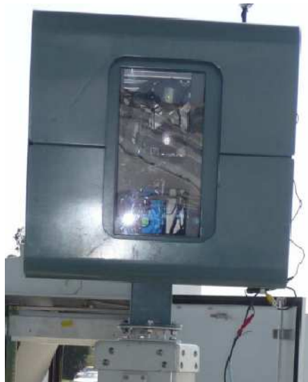
Figure 1 dtect Camera Installed at I-15

The dtect system is an infra-red camera and image processing unit designed to determine how many occupants inside a vehicle instantly. The device has a range of up to 50 meters, and is claimed to be effective on cars traveling at up to 80 miles per hour, eliminating the need for them to stop or even slow down. The dtect system operates by projecting two wavelengths of low intensity infrared light at the oncoming vehicle. As the beams are fired, each of two digital cameras, specifically coordinated to capture the infrared wavelengths, takes a photo. The accompanying software combines the two images and eliminates non-facial aspects of the photo before logging the picture with a printed timestamp, location and occupancy count. An instant after the process begins and the beams are fired, the final picture will be saved to the system's internal hard drive – with the faces masked with green blob to prevent an invasion of privacy. When the dtect system is correctly set up, and has an unhindered line of access to the windshields of oncoming automobiles, VOL claims that the accuracy rate of occupancy count is 90% . And in the ten percent of cases when it is mistaken, and challenged, the image in question can easily be examined by a human eye.