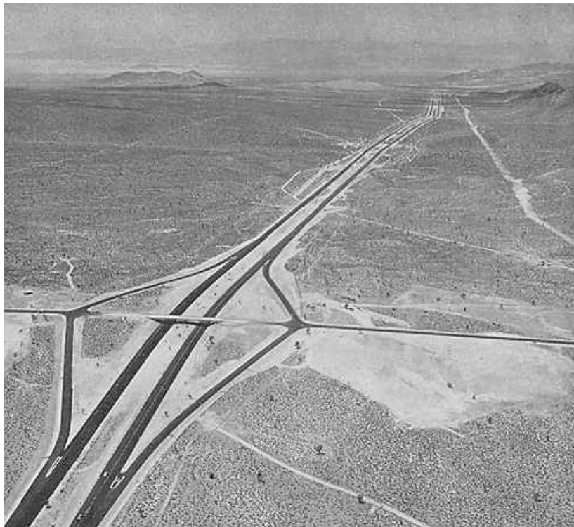
I-15 at Baker Grade (1961)