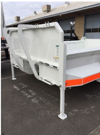
BODY LEGS DOWN FOR BETTER ACCESS WHEN HOOKING UP CABLE/ ROPE