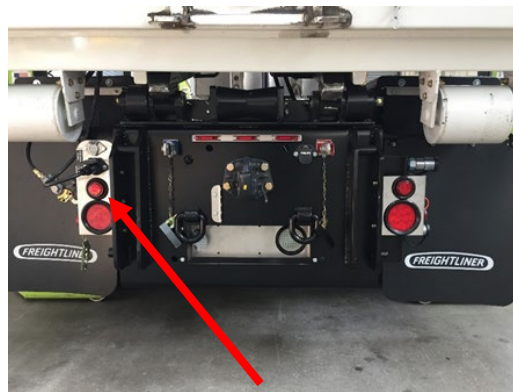
BODY AIR AND LIGHTING CONNECTIONS