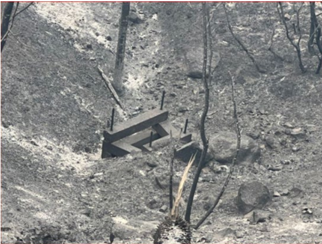
08-SBd-330– Typical Wildfire Damage