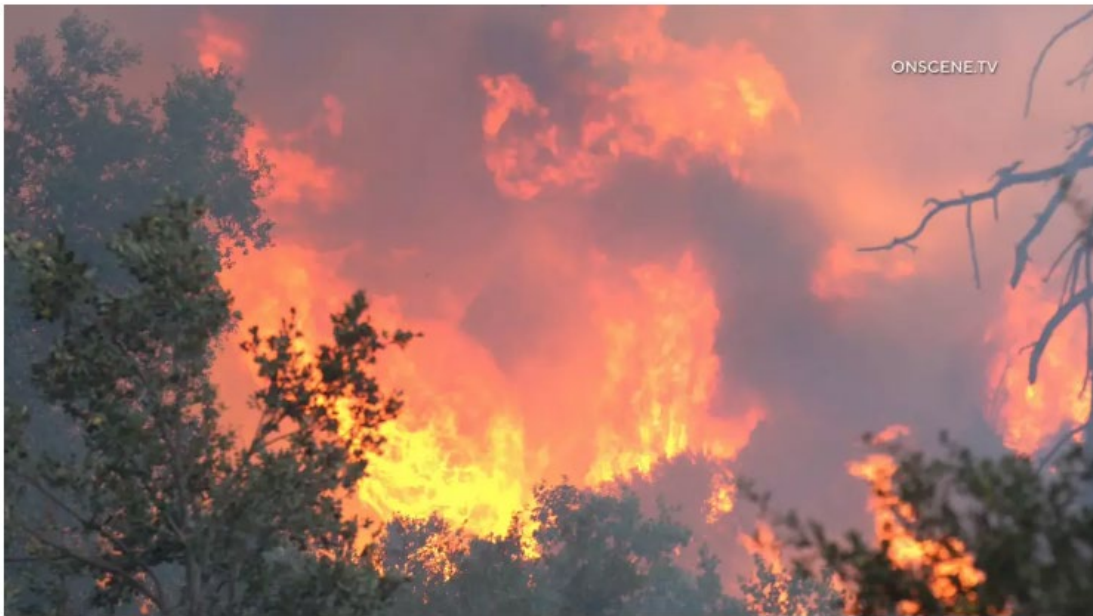
The Line fire burns near the Seven Oaks community in San Bernardino County, which was placed under an evacuation order Monday.