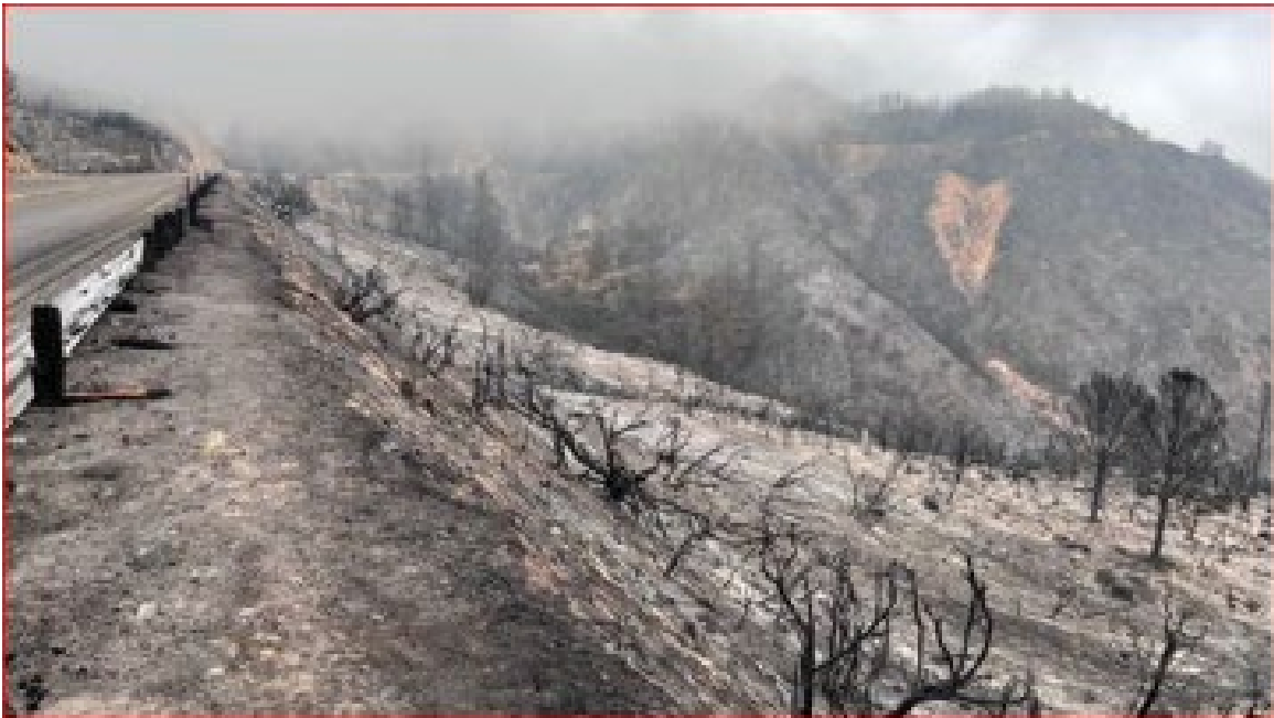
08-SBd-330– Typical Wildfire Damage