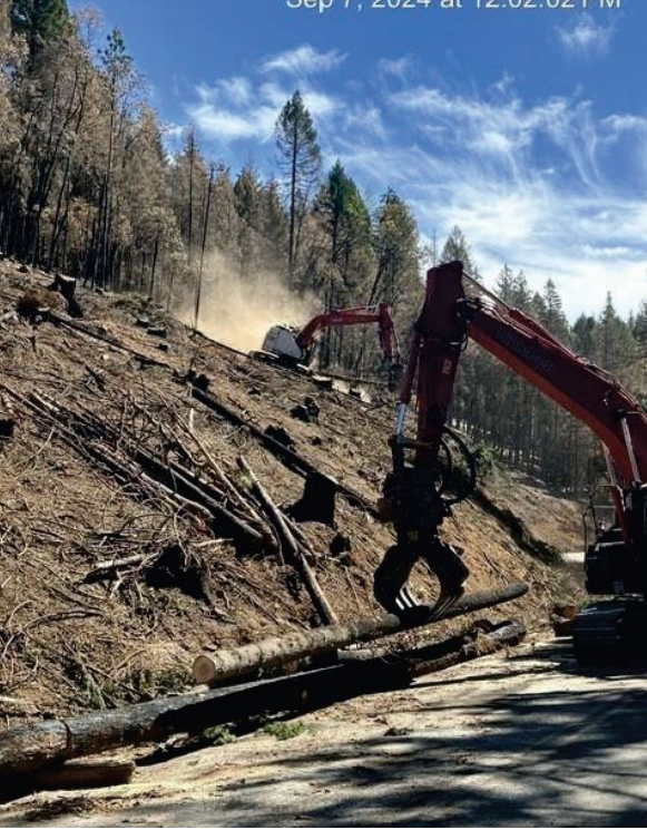
03-BUT-32 – Park Fire -typical Damages