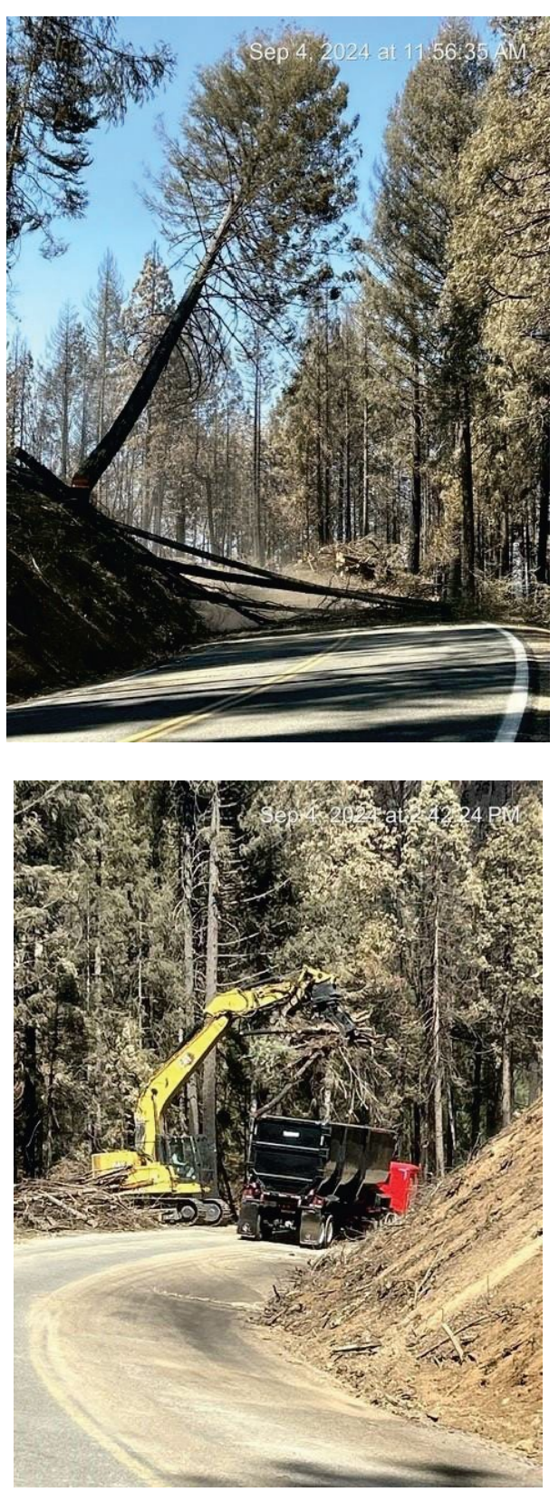
03-BUT-32 – Park Fire -typical Damages