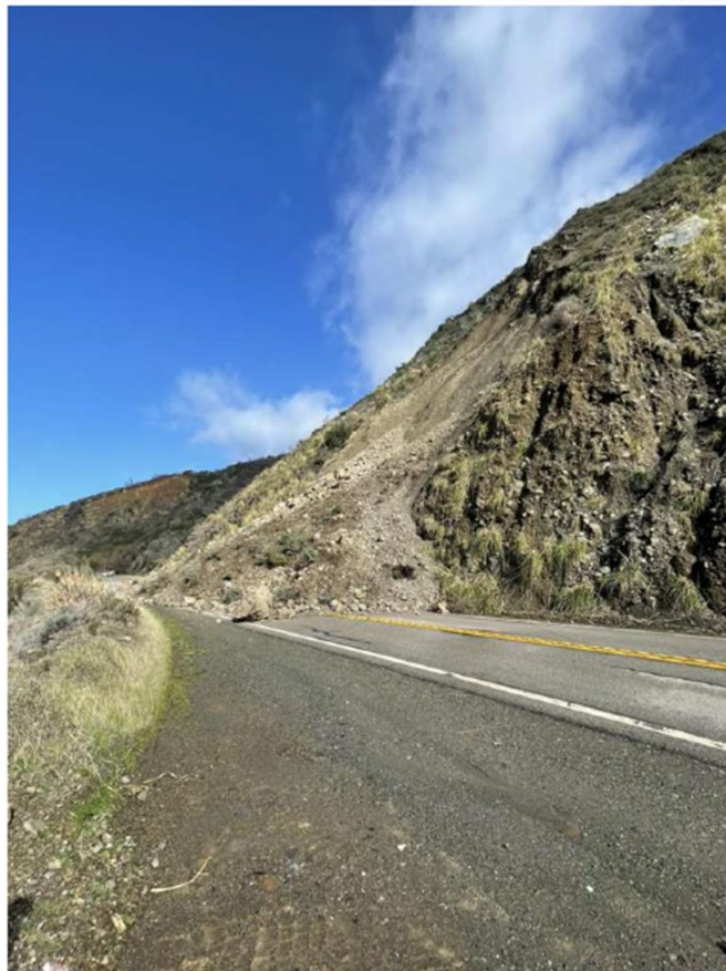
This Photograph Shows: MON-1-29.5 Rock slide blocking travelway.