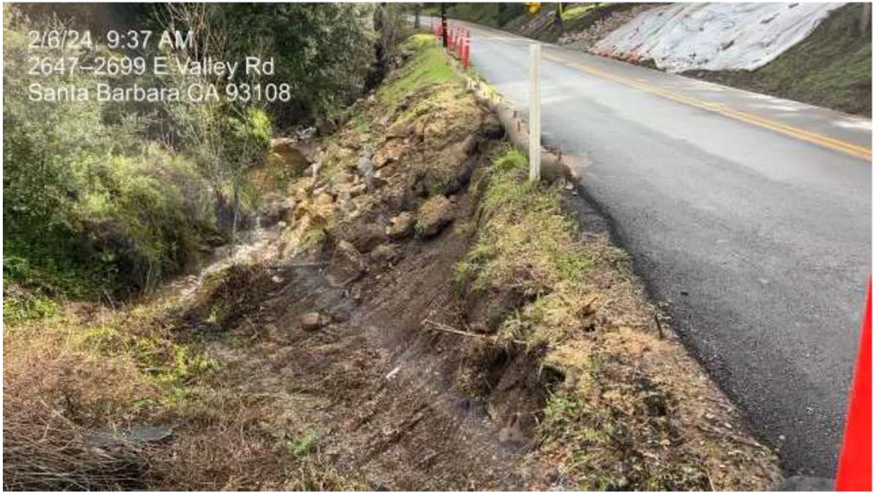
This Photograph Shows: Location 6: 05-SB-192-11.65 Slipout and erosion threatening the roadway.