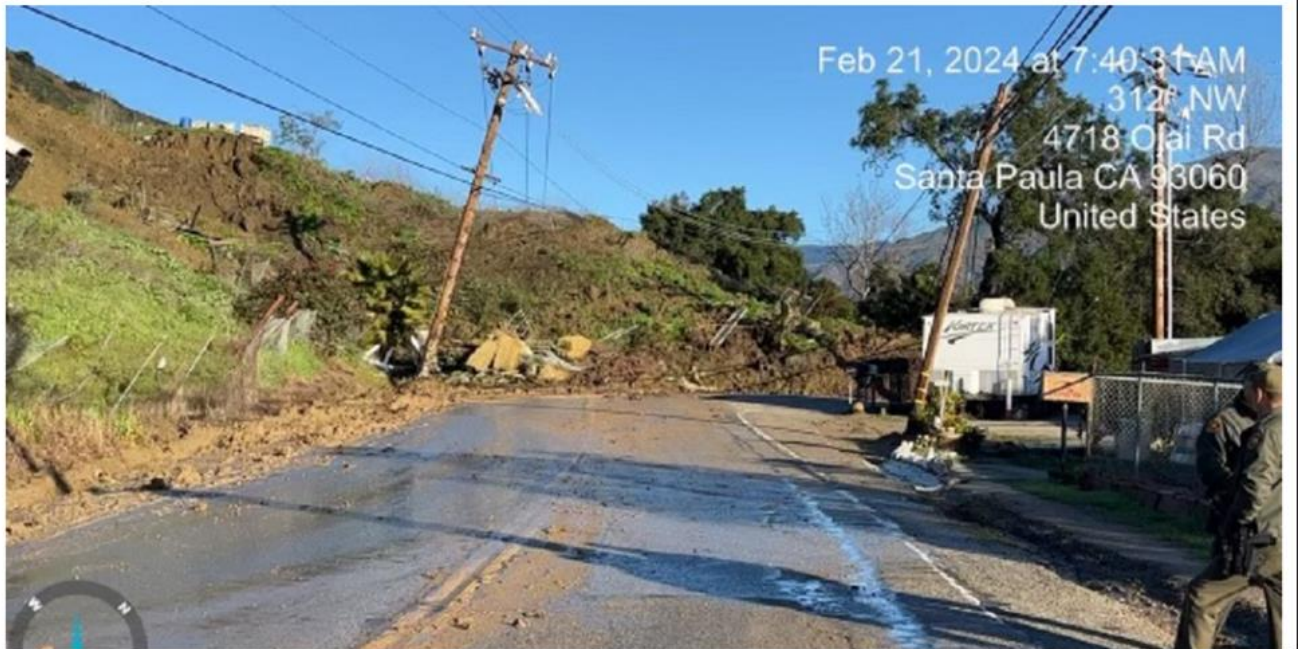
This Photograph Shows: Landslide on VEN 150 around PM 31.36 blocking both directions of travel. Telephone pole leaning.