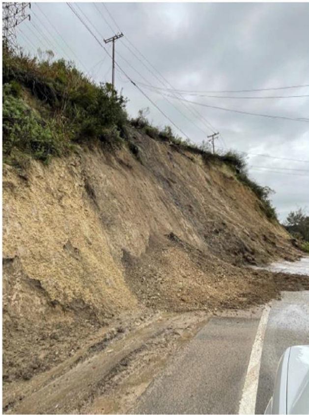
This Photograph Shows: Location 10: 05-SB-144-1.45 - Slide covering NB lane and shoulder