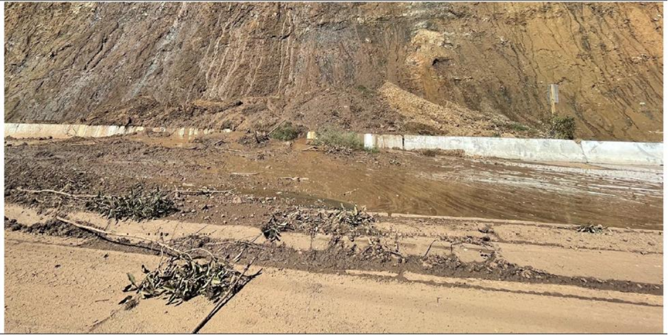
This Photograph Shows: Mudslide overtopping and covering northbound LA 1 (PCH) and overtopping the center median with debris in southbound lanes.