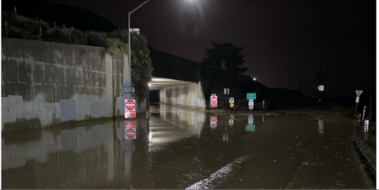
This Photograph Shows: Standing water and mud at the northbound VEN 101 off-ramp to northbound VEN 1 on 2/20/2024.