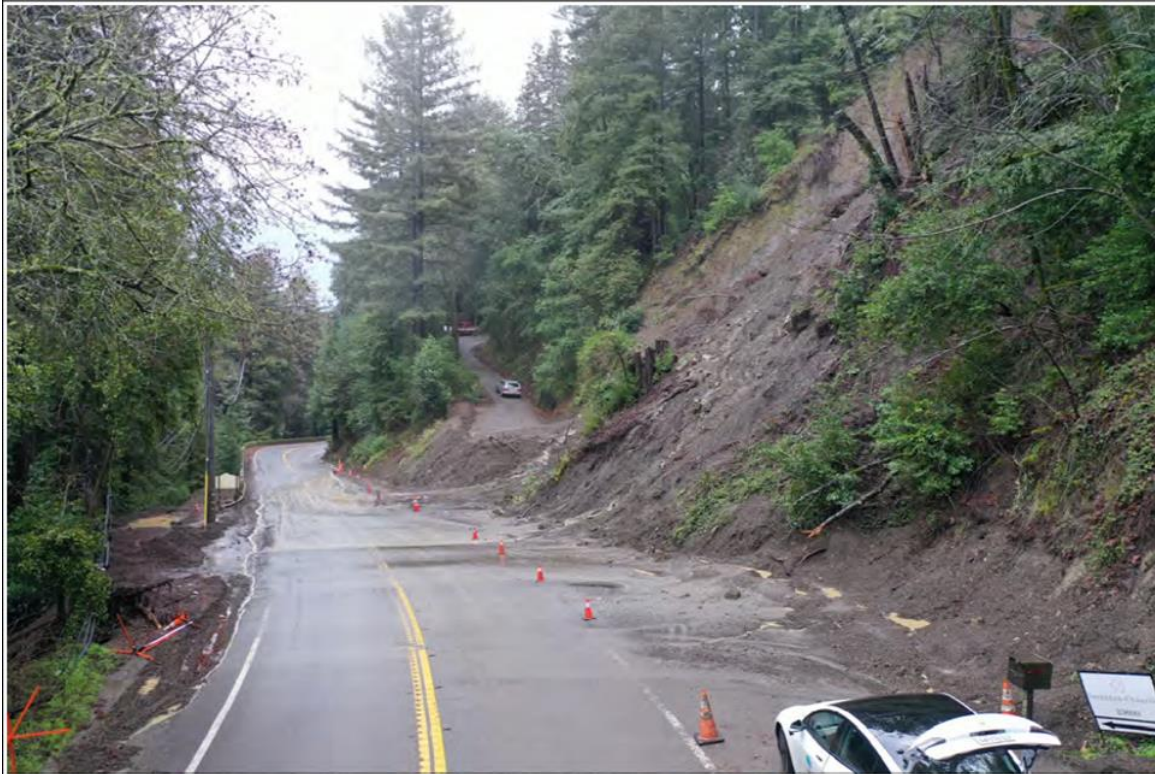
This Photograph Shows: Depicting the landslide damage at SCL-9-PM 4.0