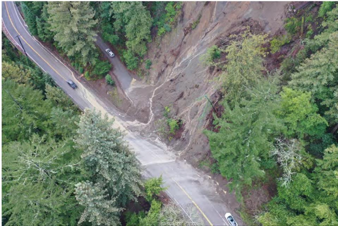
This Photograph Shows: Depicting the landslide damage at SCL-9-PM 4.0