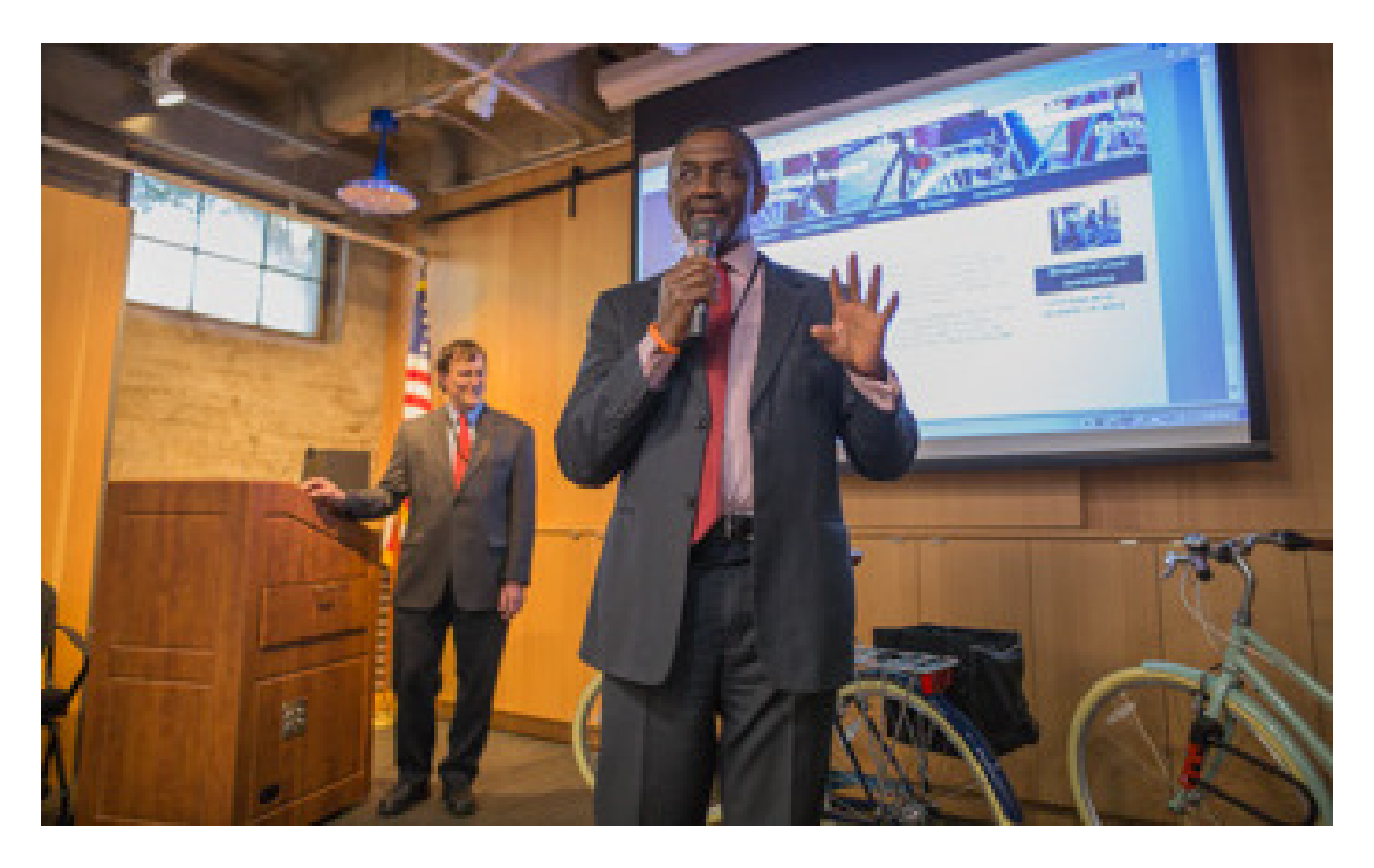
BikeShare Program kickoff event, April 2016