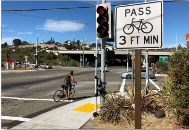
I-80: Central Ave Undercrossing Pedestrian & Bicycle Improvements (D4)