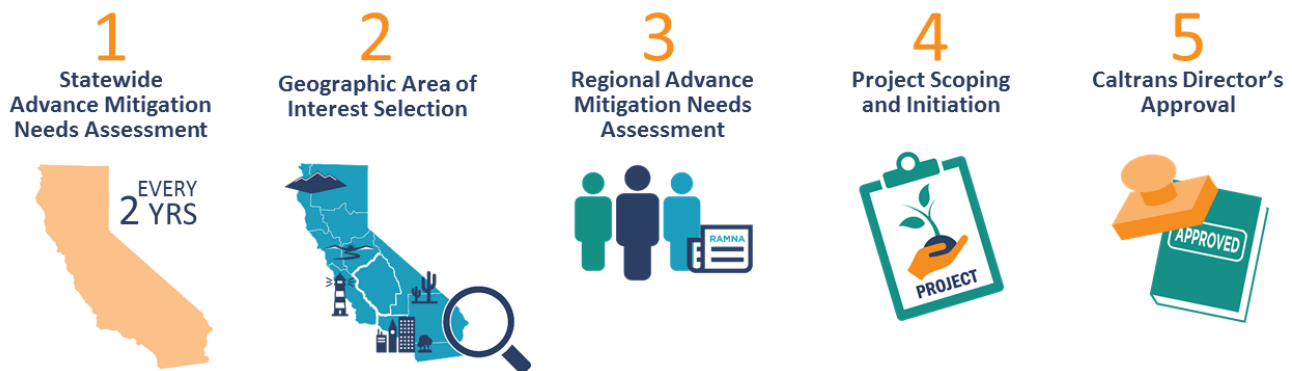
Figure 3. Advance Mitigation Program Planning Phase

Through the Advance Mitigation Program planning process, Caltrans aims to maximize the environmental benefits of planned mitigation while providing time-and cost-savings for the delivery of transportation projects. The Advance Mitigation Program planning process consists of five steps culminating in the Caltrans Director's Approval under Streets and Highways Code Section 800.6(i). As none of these planning activities can be funded from the Advance Mitigation Account, the Advance Mitigation Program has worked with the Department's Division of Transportation Planning to secure sufficient planning resources for the Caltrans districts to perform these planning activities, including the nomination and scoping of advance mitigation projects. The five steps of the Advance Mitigation Program planning phase, as illustrated in Figure 3, are as follows: