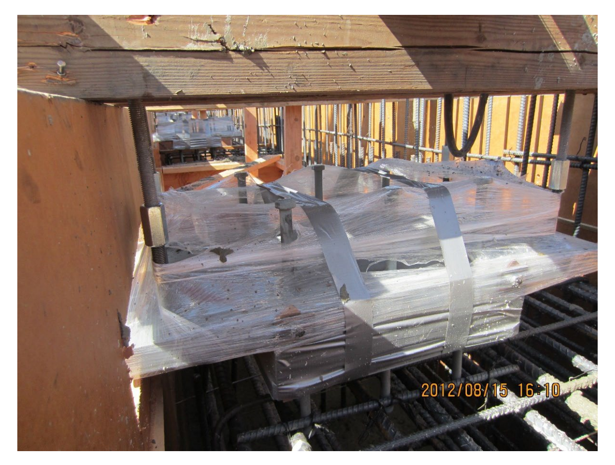
Figure 1. Protective Measures Taken to Protect the PTFE from Concrete Intrusion During Concrete Placement (SFOBB Touchdown Project)