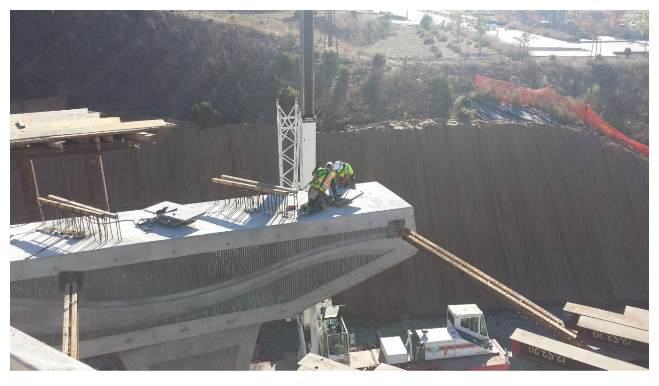
Figure 3. Installation of PTFE Spherical Bearings (Petaluma River Bridge Project)