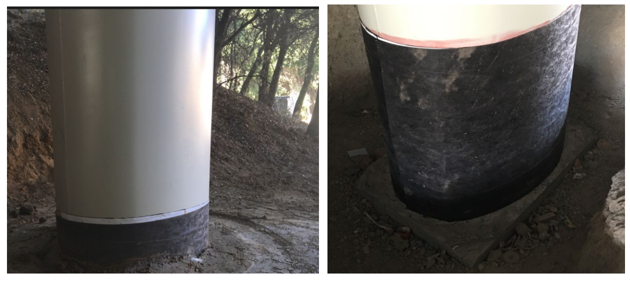
Figure 5. Waterproofing for Column Casing

Shown in Figures 5 and 6 is sheet waterproofing membrane for column casings on Bridge No. 33-0351, Calaveras Road Separation, in District 4.