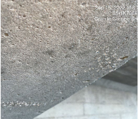
Figure 4. Silane Waterproofing Tested 7 Days After Application Depicts Proper Water Beading on Treated Surface

Shown in Figures 5 and 6 is sheet waterproofing membrane for column casings on Bridge No. 33-0351, Calaveras Road Separation, in District 4.