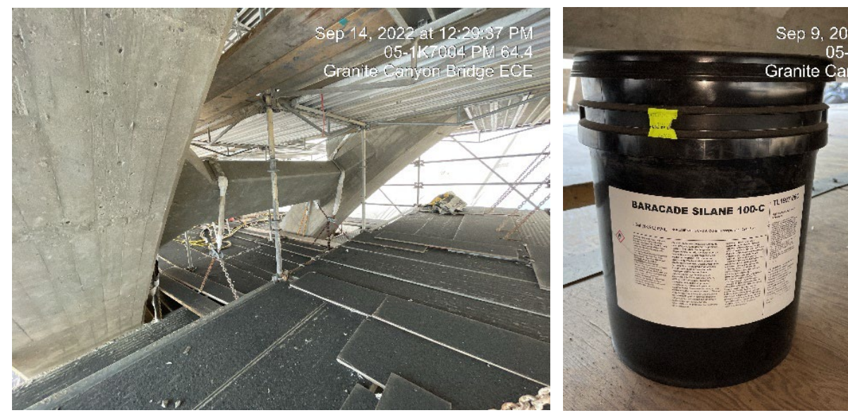
Figure 1. Concrete Surface Prepared for Application of Silane Waterproofing per SSPC-SP 13/NACE No. 6

Shown in Figures 1-4 are photographs for waterproofing at Bridge No 44-0144, Granite Canyon Bridge, in District 5.