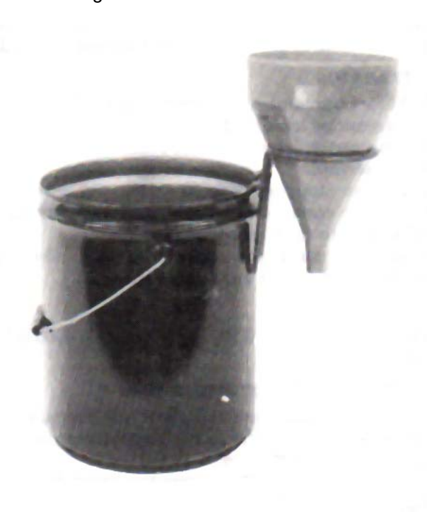
Figure 2: GROUT EQUIPMENT