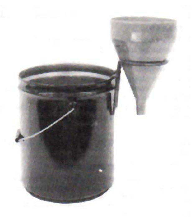
Figure 2: Grout Equipment