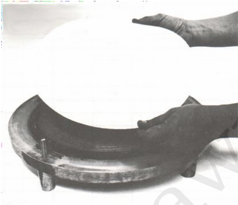
FIGURE 3. Filter Paper Being Placed on Support