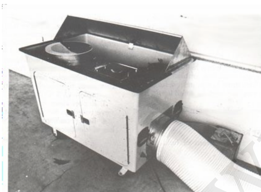
FIGURE 1. Ultrasonic Bath, A Commercial Extraction and Vacuum Pump