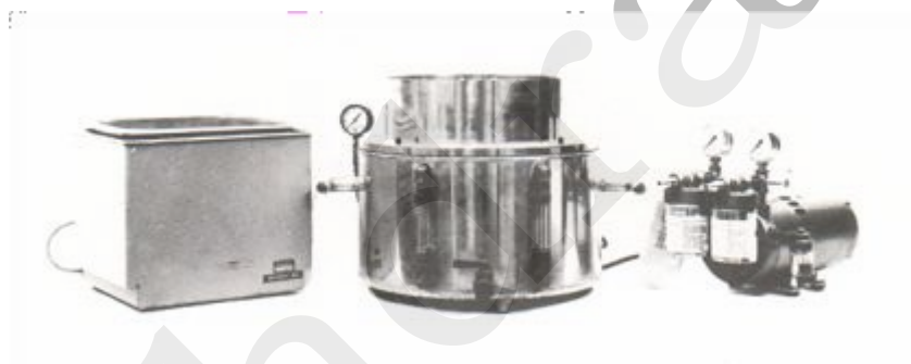
FIGURE 2. Portable Cart with Exhaust Fan