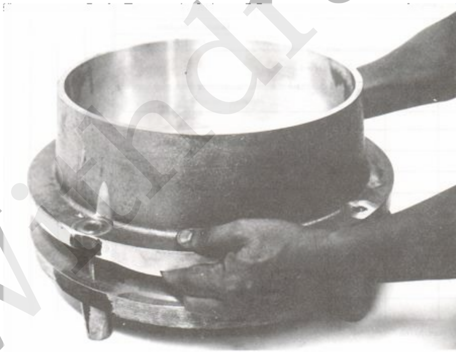
FIGURE 4. Funnel Ring Being Placed on filter Support