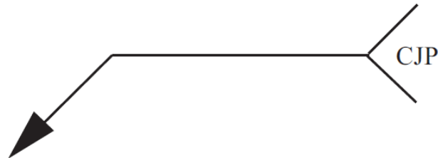
Figure 11.3.1 CJP Welding Symbol

The welding symbol for CJP weld does not denote weld size: