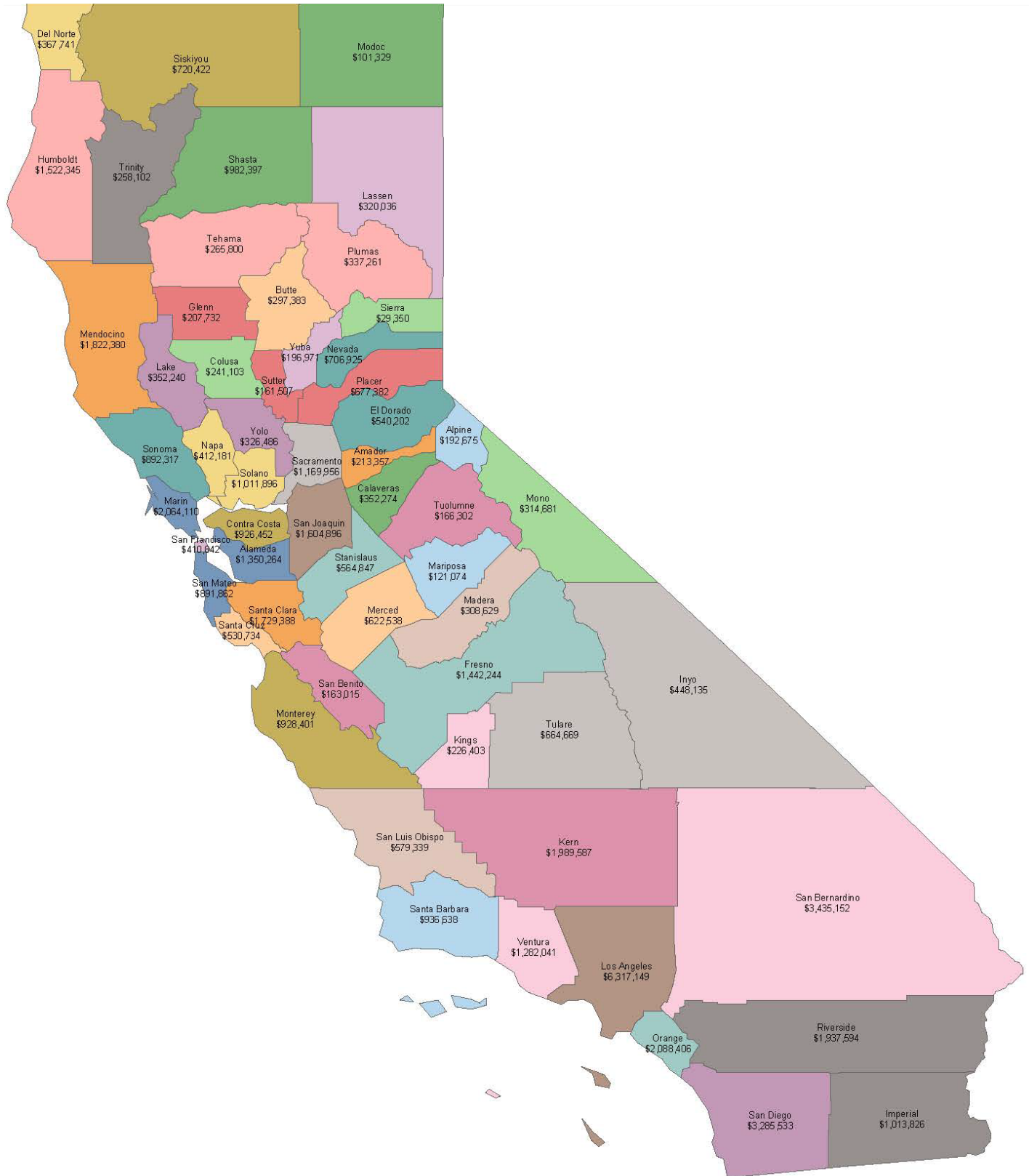
Figure 1 – Map of County Project Cost Summary ($K)