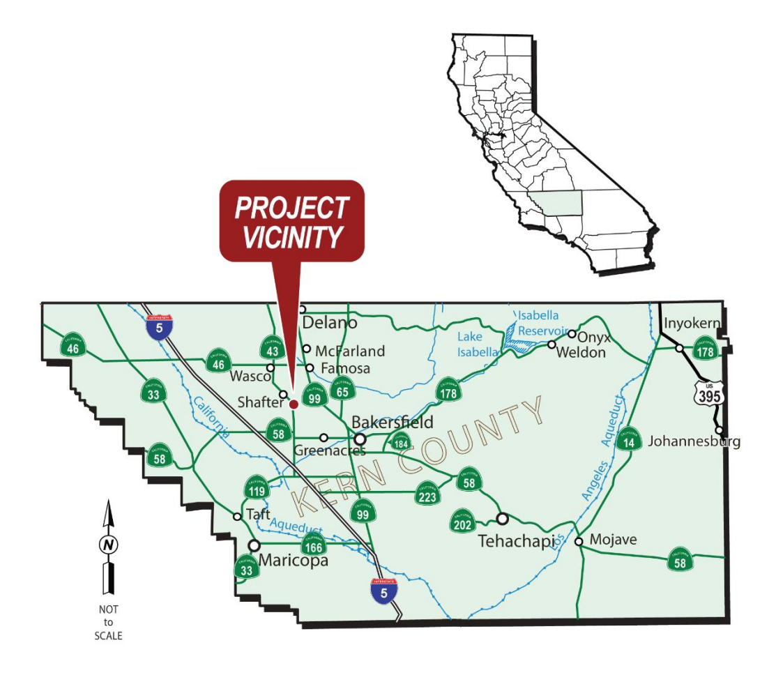
Figure 1-1 Project Vicinity Map

pavement, and a separate jointed plain concrete pavement truck apron would accommodate standard Surface Transportation Assistance Act trucks at the center of the roundabout.