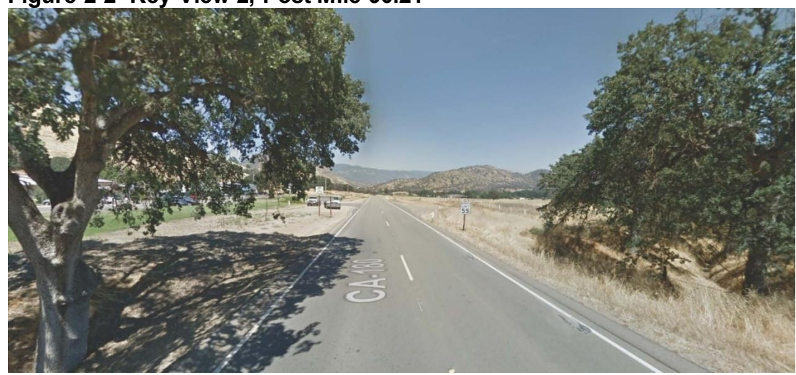
Figure 2-2 Key View 2, Post Mile 90.21

Key View 1, Post Mile 89.48—From near George Smith Road looking northeast. The expected level of change to this view would be low. Few to no trees would be removed, and the view would be relatively intact. Viewer exposure would be moderate, and viewer sensitivity would be moderate to high. The overall level of viewer response would be moderate to high.