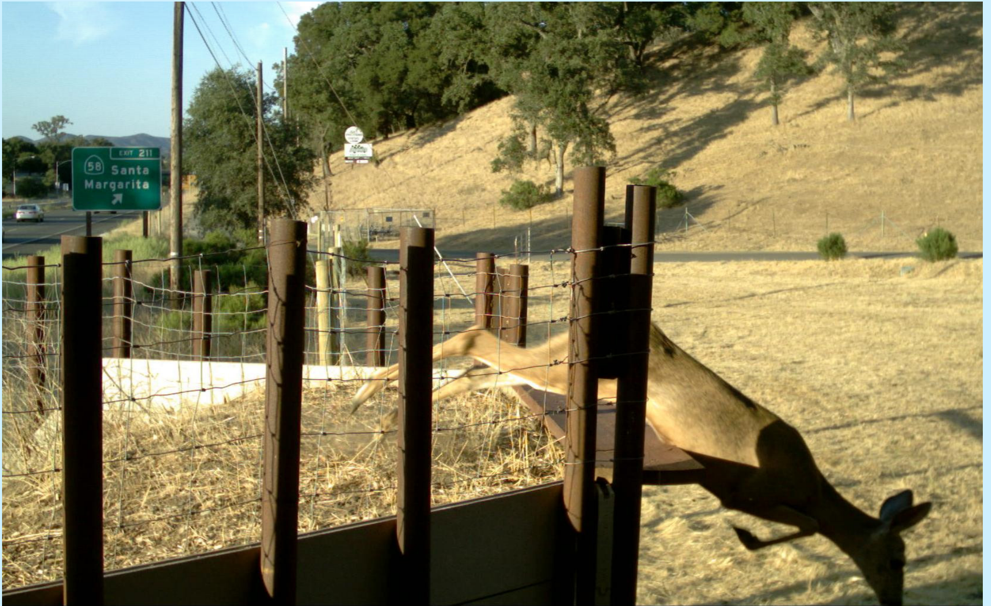
Hwy 101 SLO County Cuseta Grade