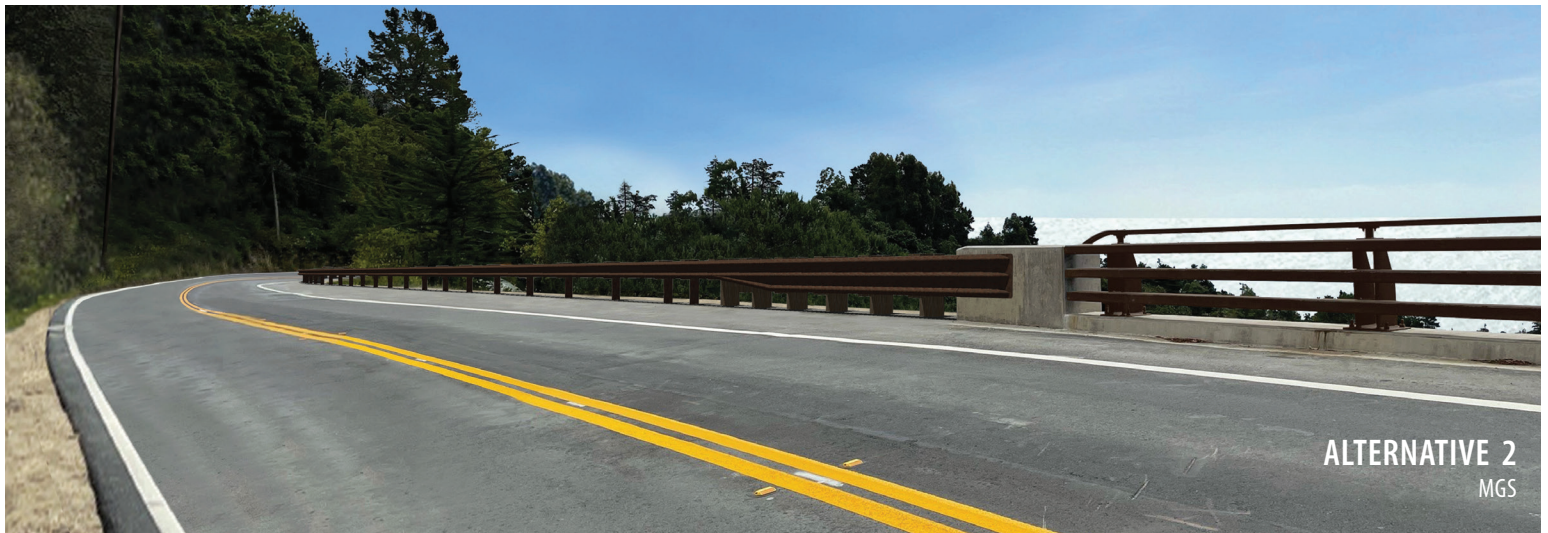
ALTERNATIVE 2 MGS