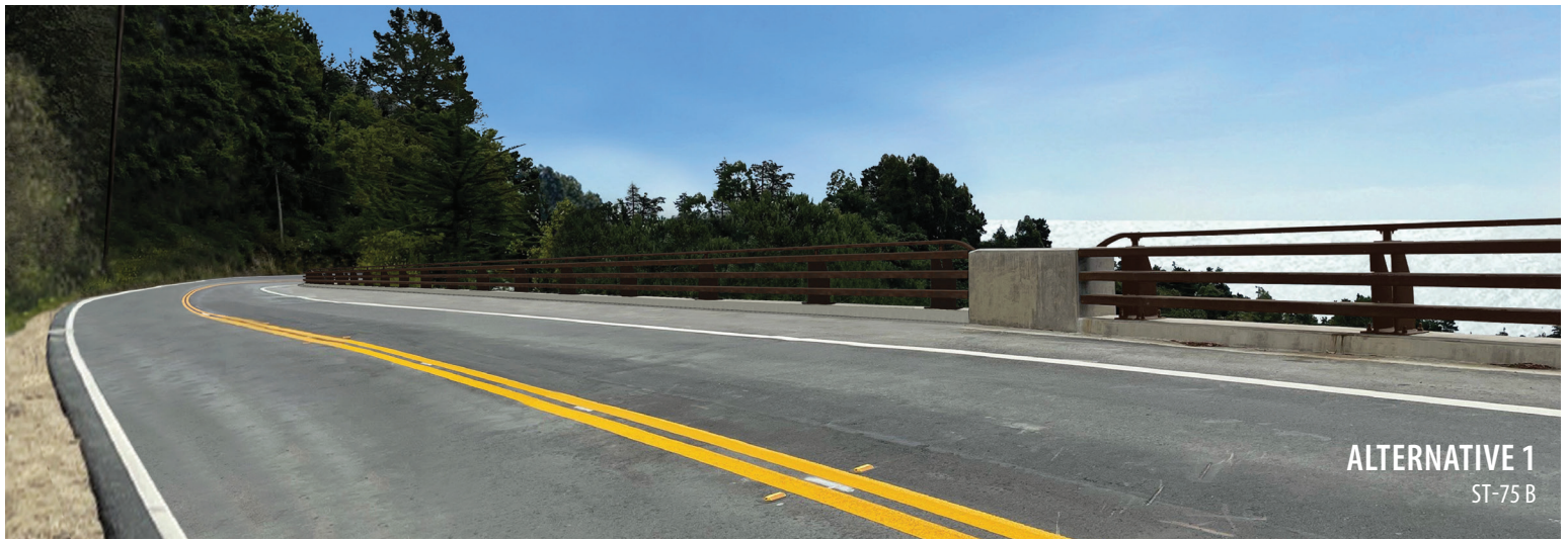
ALTERNATIVE 1 ST-75 B