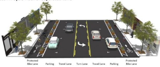
Class IV: Cycle Track or Separated Lane

(Above an example of a class IV bike lane.)