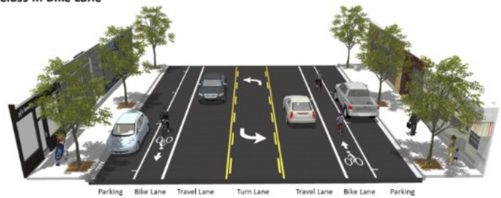
(Example of a Class II Bike Lane)

improve safety by giving bicyclists a clear, consistent space and reduce conflicts with drivers by making it a more predictable path of travel for everyone.