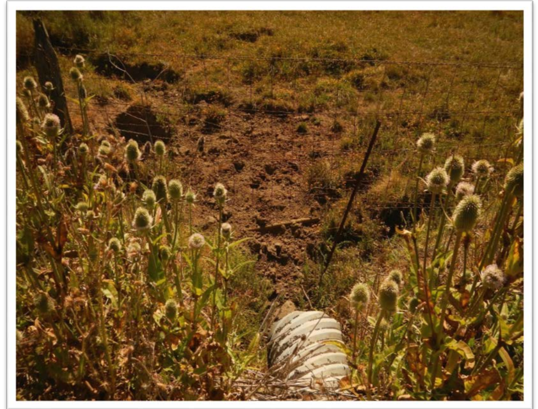
View of a culvert under State Route 1 north of Point Reyes Station, at Post Mile 30.5