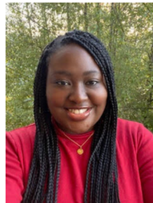
VST MYDRIA CLARK