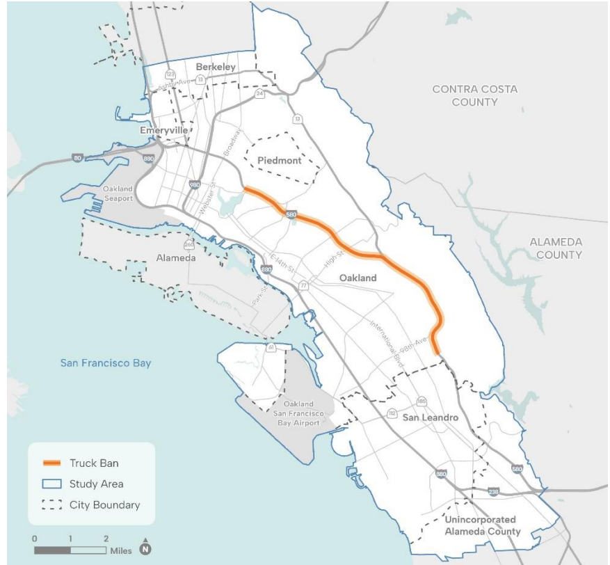
I-580 Truck Access Study Area Map