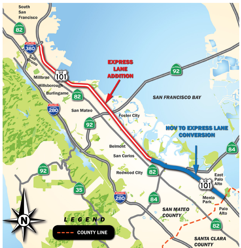
▲ Project Location Map