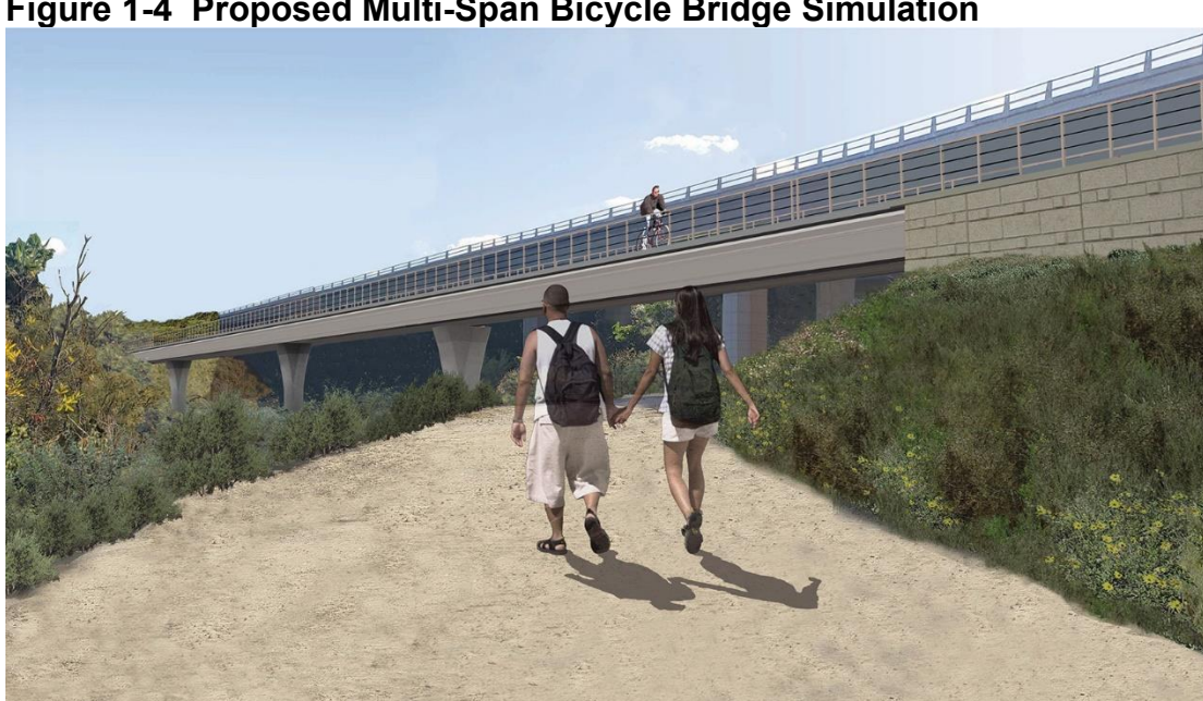
Figure 1-4 Proposed Multi-Span Bicycle Bridge Simulation

The Multi-Span Bicycle Bridge has been selected as the preferred variation.