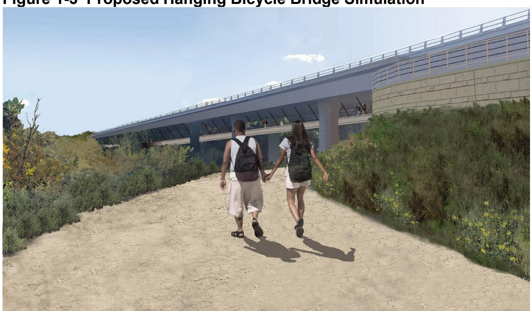
Figure 1-3 Proposed Hanging Bicycle Bridge Simulation

This Hanging Bicycle Bridge has not been selected as the preferred variation.