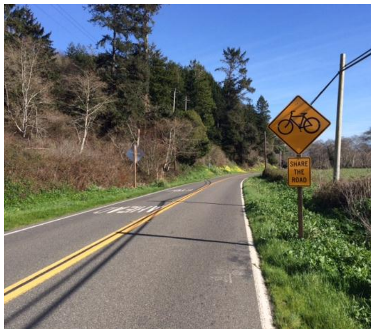
A typical section of Route 200