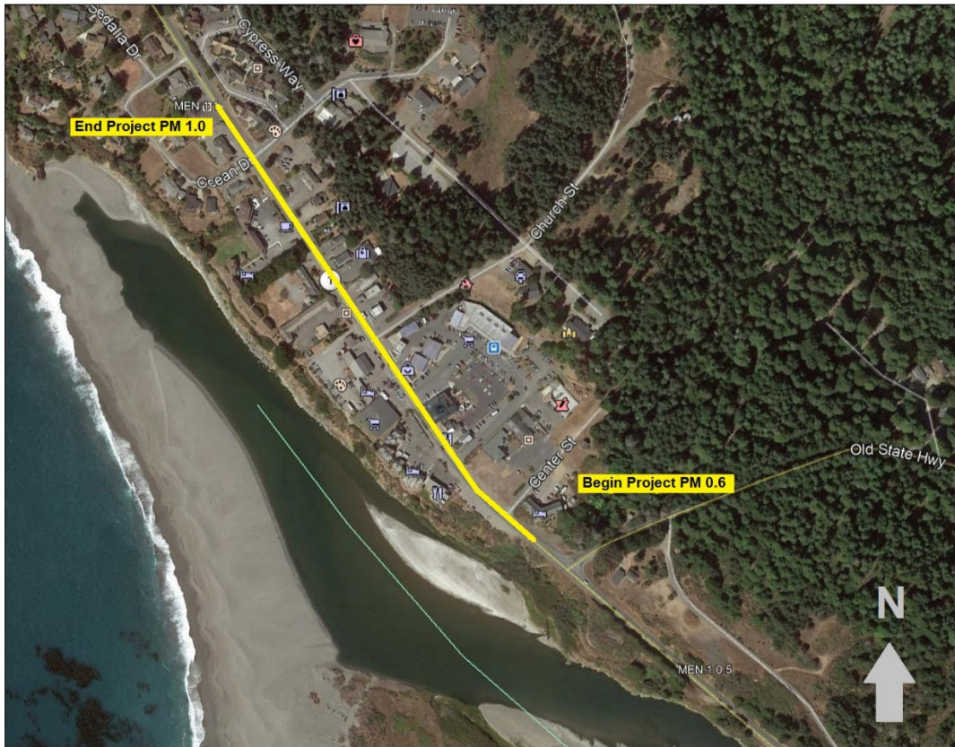
Project Vicinity Map: In Gualala, the project is located on SR 1 between post miles 0.6 and 1.0.