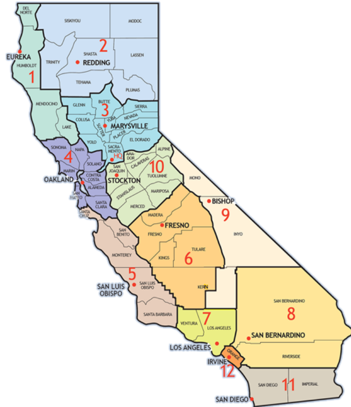
California's counties by name, abbreviation and district