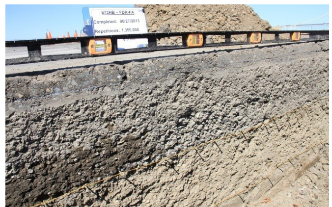
Image 1: Test pit after accelerated wheel load testing on FDR section with foamed asphalt and cement stabilization. An equivalent of 34 million ESALs was applied to this section, resulting in 6mm of rut, but no cracking.