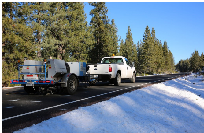
Image 2: FWD testing on PLU147 to assess stiffness change over time. This was an FDR project where Portland cement was used as the stabilizer.