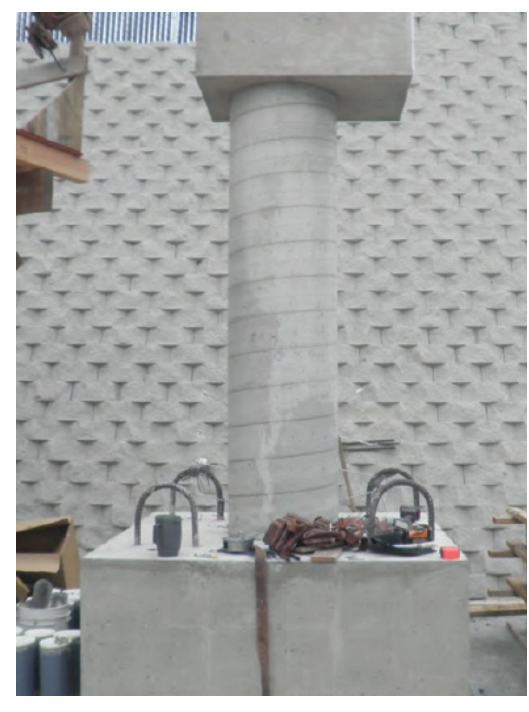
Figure 2: Completed cast-in-place column model