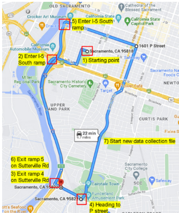
Image 2: Data collection route for two on-ramps in the Sacramento area.