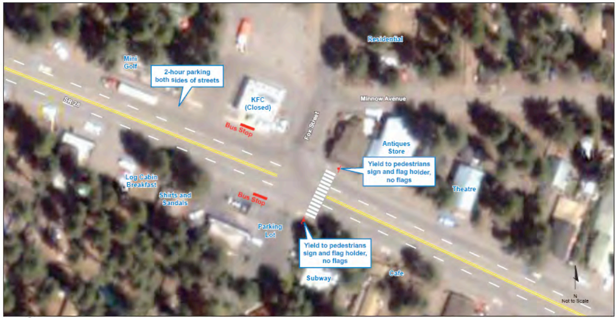
Insert Figure 2 – Fox Street