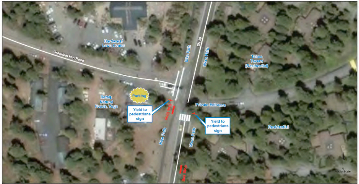
Caltrans Tahoe Crosswalks GRANLIBAKKEN ROAD AND SR 89