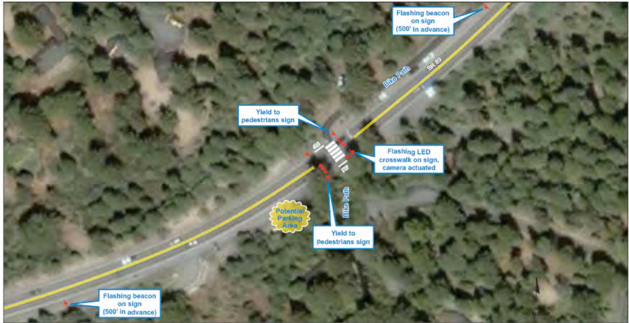
Caltrans Tahoe Crosswalks SEQUOIA BIKE PATH CROSSING ON SR 89 fp FEHR & PEERS TRANSPORTATION CONSULTANTS JUNE 2009 DPO 6384