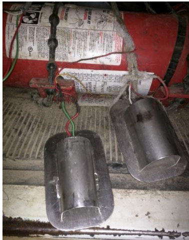
Figure 2.2: The 0506 seat vibration motors