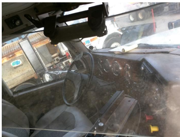
Figure 2.1: The 0024 snowplow combiner before cleaning