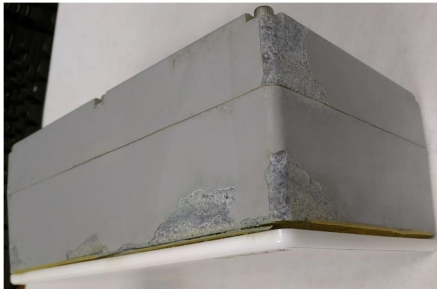
Figure 3.1: Heated enclosure ver. 1.1. Adhesive failure causing delamination between the aluminum enclosure and the Delrin fascia

delamination of the front fascia of the heated enclosure ver. 1.0 from interfering with the heated wiper operation. The radar enclosure icing mitigation system ver. 1.5 was installed on both the 0024 and 0506 snowplows on 04/05/2016. Previous test results show that the heated enclosure ver. 1.2 will eventually fail due to delamination since the design did not change from that of the previous enclosure which did delaminate. Any new radar enclosure icing mitigation system should be designed so that it does not have any epoxy joints or metal that can corrode. The solution to this problem is to design away from any adhesive joint and non-anodized aluminum. AutonomouStuff currently provides sealed (non-heated) enclosures for ESRs used in the mining industry. Their new sealed enclosures for the mining industry use rubber gasket and mechanical fasteners to secure the front fascia onto the aluminum housing. The snowplow DAS does not require the factory-sealed ESR to be housed inside any sealed enclosure since the ESR is already sealed. The AutonomouStuff heated enclosure happens to be sealed.