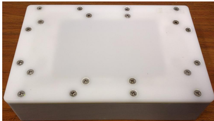
Figure 3.2: Heated enclosure ver. 1.2. AHMCT added mechanical fasteners to prevent delamination in the event of adhesive failure between the aluminum enclosure and the Delrin fascia