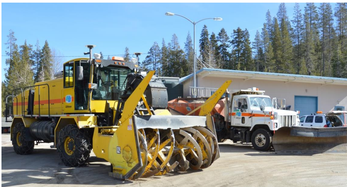
Figure 1.1: Snowplow Driver Assistance System installed on Caltrans snow blower (yellow) and snowplow (white)

Snow removal operations during a whiteout snowstorm are one of the most difficult tasks that winter maintenance personnel face. Researchers at the University of Minnesota and the Advanced Highway Maintenance and Construction Technology (AHMCT) Research Center, along with our research partners at the California Department of Transportation (DOT) (Caltrans), have long considered the benefits of providing driver guidance information to enhance winter maintenance activities. The University of Minnesota developed an innovative driver assistance system (DAS) for snowplows using the Global Positioning System (GPS), an automotive radio detection and ranging (radar or RADAR) system, a novel Head-Up Display (HUD), and a haptic feedback seat system using vibrating motors. They have installed and successfully tested systems on snowplows in Minnesota and Alaska. MTS, a Minnesota company, licensed the DAS from the University of Minnesota and has installed the DAS snowplow driver assistance system on two snowplows and one snow blower based at the Caltrans Kingvale maintenance facility next to Interstate 80 (I-80) (see Figure 1.1).