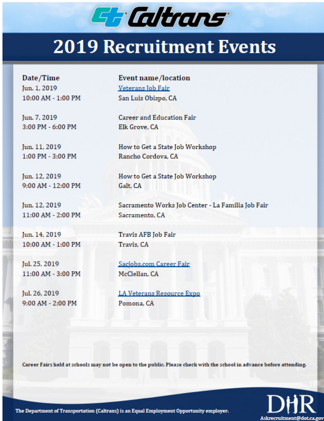
Table 3: Recruitment Calendar

While statewide hiring efforts are on track to hire almost 1,500 staff for the current fiscal year, moving forward the COS Program is monitoring workload and attrition going into the next fiscal year and will develop strategies (as necessary) to temper or increase hiring efforts to balance and address current and future fiscal year resource and workload needs.