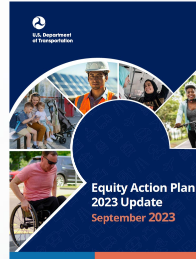
Left: Equity Action Plan 2023 Update