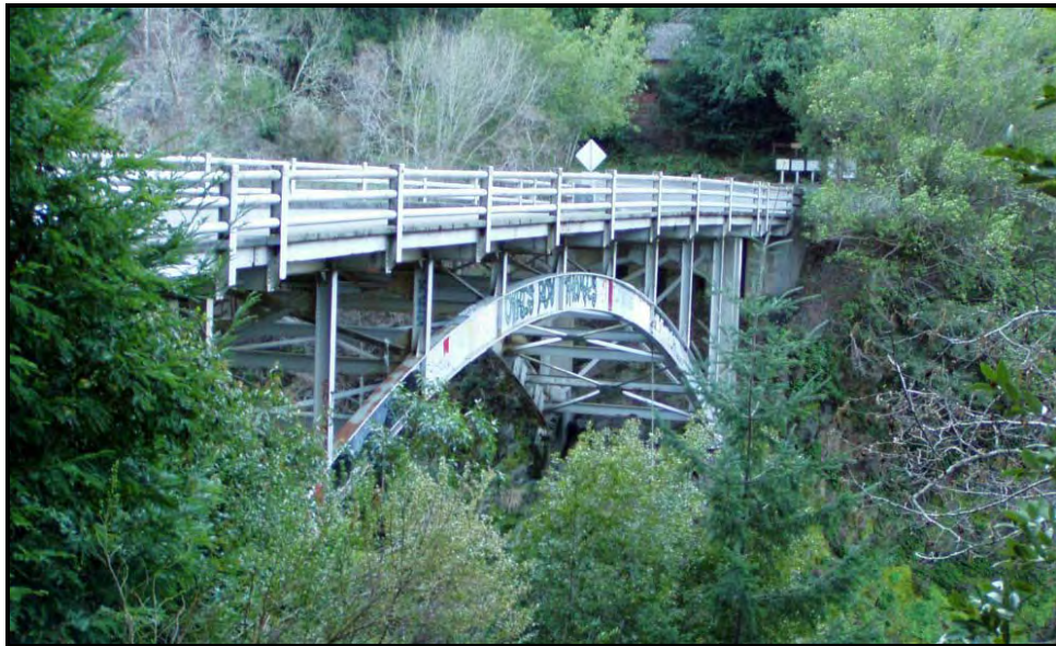
Photograph 13: George E. Tyron Bridge (01C0005) built 1948, South Fork Road over South Fork of Smith River. March 2003.