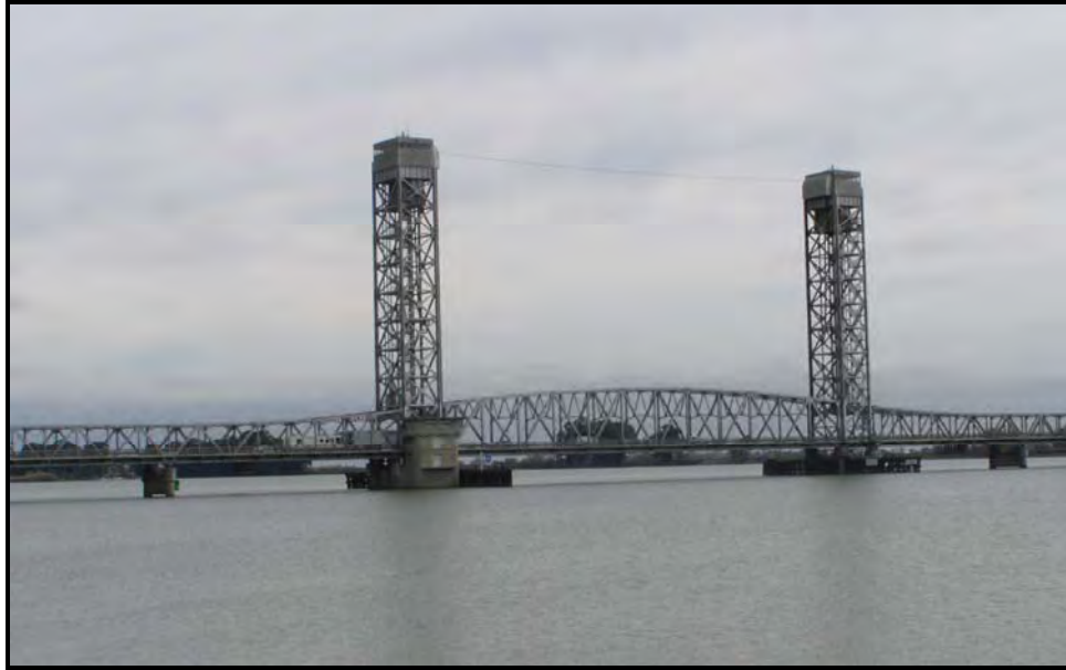
Photograph 15: Rio Vista Bridge over Sacramento River (23 0024) built 1944/1960. March 2003.