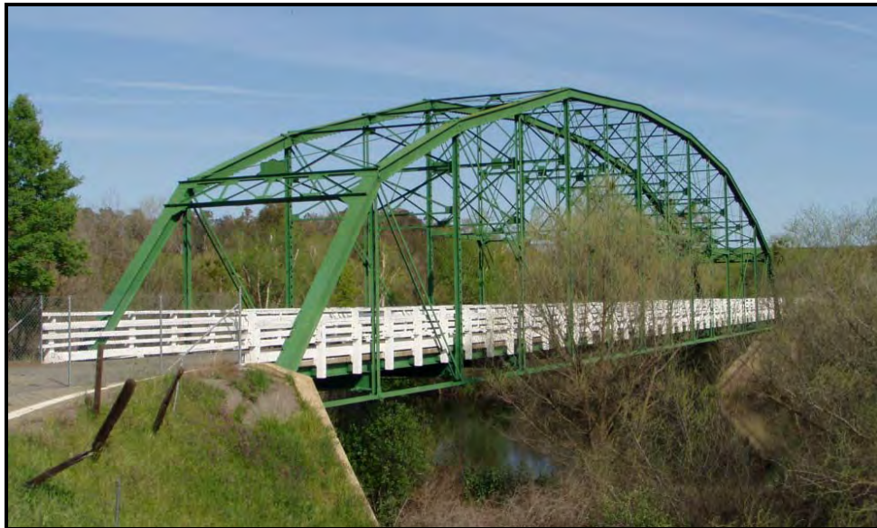
Photograph 1: Bassos Ferry Bridge (3 8C0317Z) over Tuolumne River, built 1911. April 2003.

and of moderate length, though they were utilized for extraordinary situations, particularly where a movable structure was needed or a long span was required. 2