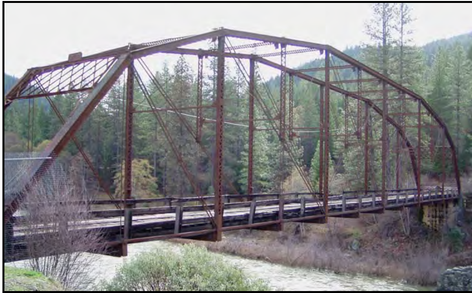
Photograph 10: Scott River Bridge (02C0021), Roxbury Drive, built 1915. Example of a Pennsylvania Petit truss. January 2003.