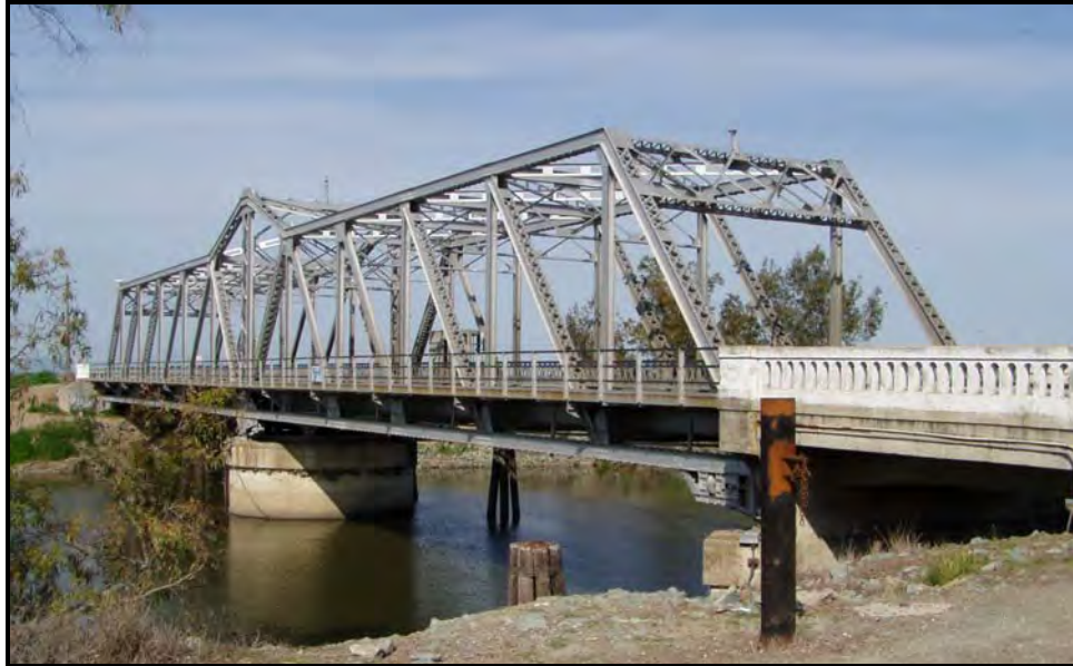
Photograph 14: Garwoods Bridge (29 0050) built in 1933 on State Route 4. April 2003.

engineers favored bascule type bridges, yet continued to build some swing bridges. 32 Of the 34 remaining movable bridges in California, fifteen are swing bridges, such as the Garwoods Bridge (29 0050) over the San Joaquin River, shown in Photograph 14.