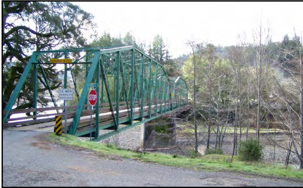
Photograph 8: Mattole River Bridge (04C0055), Mattole Road, built 1920. Example of a Camelback truss. February 2003.