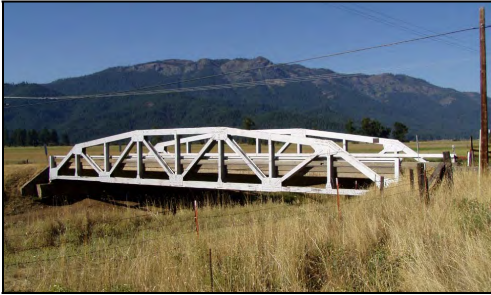
Photograph 5: Lights Creek Bridge (09C0012) on Beckwourth-Greenville Road, built 1947. Example of a Warren truss. August 2003.