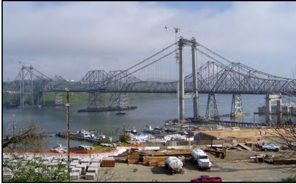
Photograph 4: Carquinez Strait Bridges (23 0015L and 23 0015R), built 1927 and 1958, with new suspension bridge in foreground. February 2003.