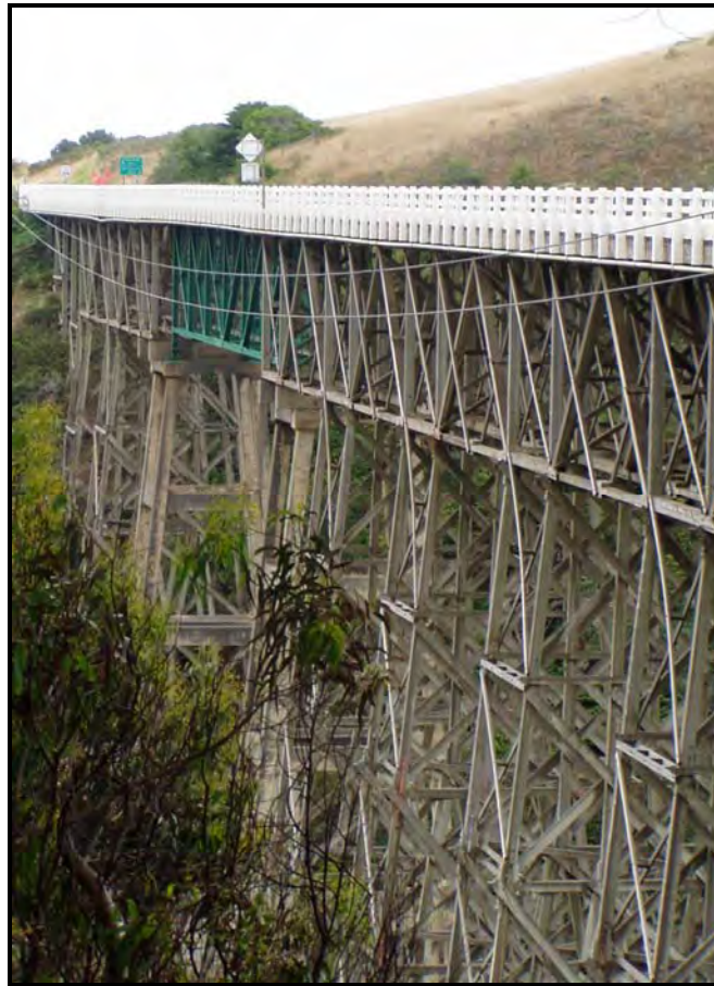
Photograph 3: Bridge 10 0136, SR1 over Albion River, built 1944. August 2003.

steel Baltimore Petit truss over the waterway flanked by concrete tower bents. Its metal truss was reused from an abandon railroad line in Butte County. 13