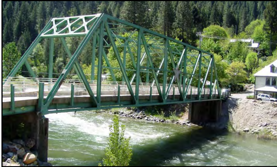
Photograph 17: Nevada Street Bridge over North Fork Yuba River (13C0006), built 1938. May 2003.

(13C0006) built in 1938, shown in Photograph 17, as well as medium to large scale bridges such as portions of the Golden Gate and Oakland Bay Bridges (1930s), the Highway 101 bridge over the Eel River at Scotia (04 0016R) (1941), and the Jellys Ferry Bridge (08C0043) that crossed the Sacramento River north of Red Bluff (1949).