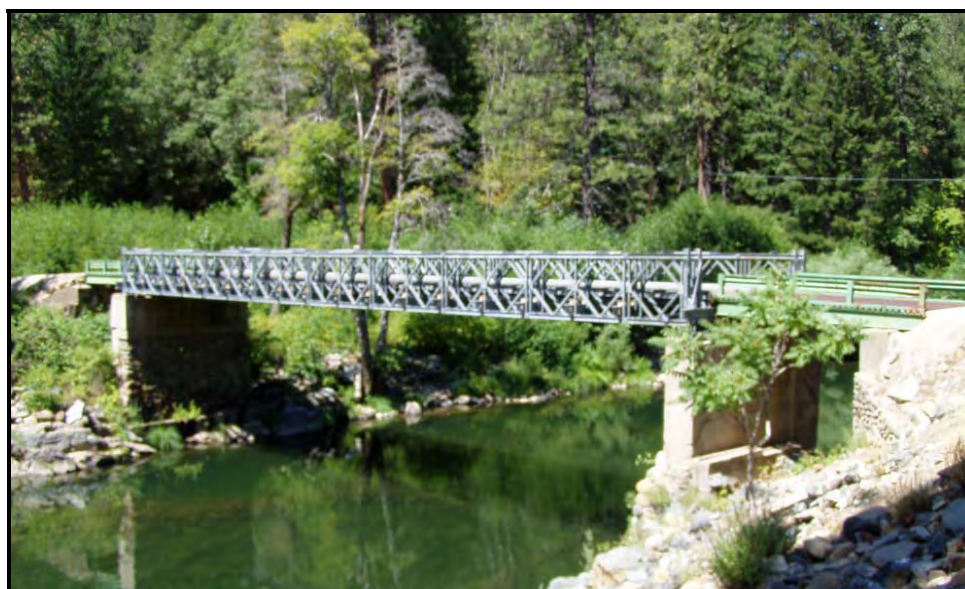
Photograph 11: Rich Bar Road Bridge (09C0041) built over the East Branch of the North Fork of the Feather River in 1951 using abutments and piers from previous bridge built in 1932. Example of a Bailey truss. August 2003.

load capabilities decreased. A single story, single truss Bailey bridge could span ninety feet, and safely carry 16 tons. Adding another truss to the bridge both increased the span length and allowable tonnage, so that a single story, double truss bridge could span up to 130 feet and handle up to 18 tons. Shorter spans with additional trusses could manage larger loads, such as the Rich Bar Road Bridge (09C0041), shown in Photograph 11.