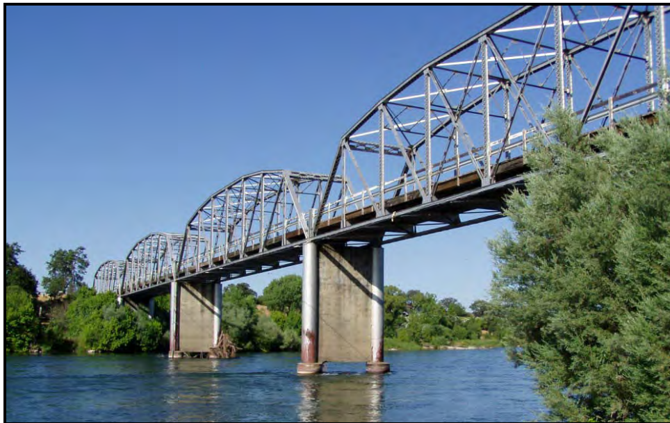
Photograph 7: Jellys Ferry Road Bridge (08C0043) over Sacramento River, built 1949. Example of a Parker truss. June 2003.

In the 1870s, as trains began to carry larger and heavier loads, engineers devised variations on the Pratt truss which enabled them to span longer distances and carry greater loads. Railroads took advantage of a new truss that utilized sub-struts and sub-ties to provide additional support. The Baltimore and Ohio Railroad initially built several of this new form, which earned it the name Baltimore Petit, in 1871. In 1875, the Pennsylvania Railroad added an arched top chord and called its version the Pennsylvania Petit. Other railroad lines gradually adopted these two styles, and later these truss types were adapted for highway use. 27 The Lewiston Bridge (05C0032) in Photograph 9 is an example of a Baltimore Petit truss, and the Scott River Bridge (02C0021) in Photograph 10 is an example of a Pennsylvania Petit truss.