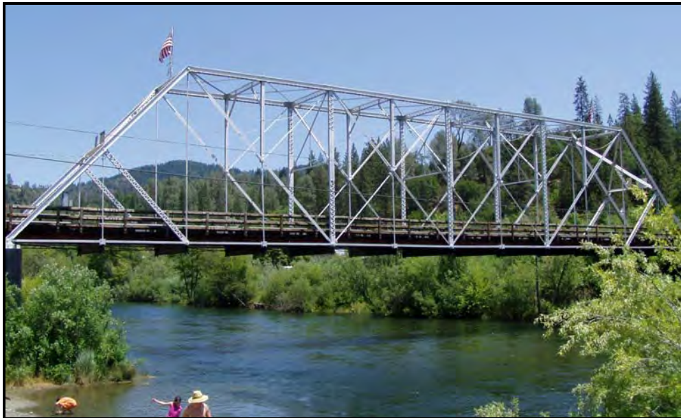
Photograph 9: Lewiston Bridge (05C0032), Turnpike Road over the Trinity River, built 1901. Example of a Baltimore Petit truss. June 2003.