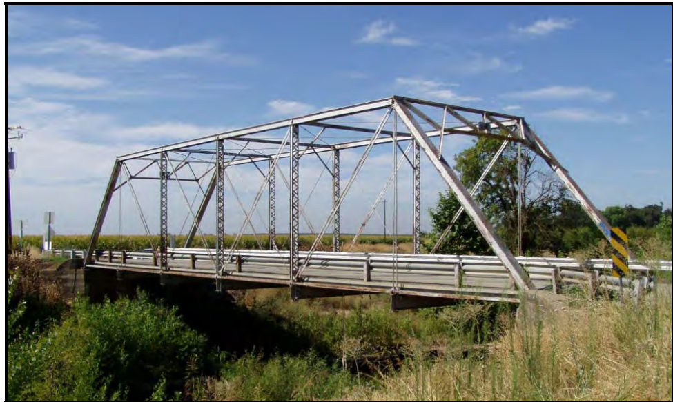
Photograph 6: Butte Creek Bridge on Durnell Road (12C0023), built in 1904. Example of a Pratt truss. August 2003.