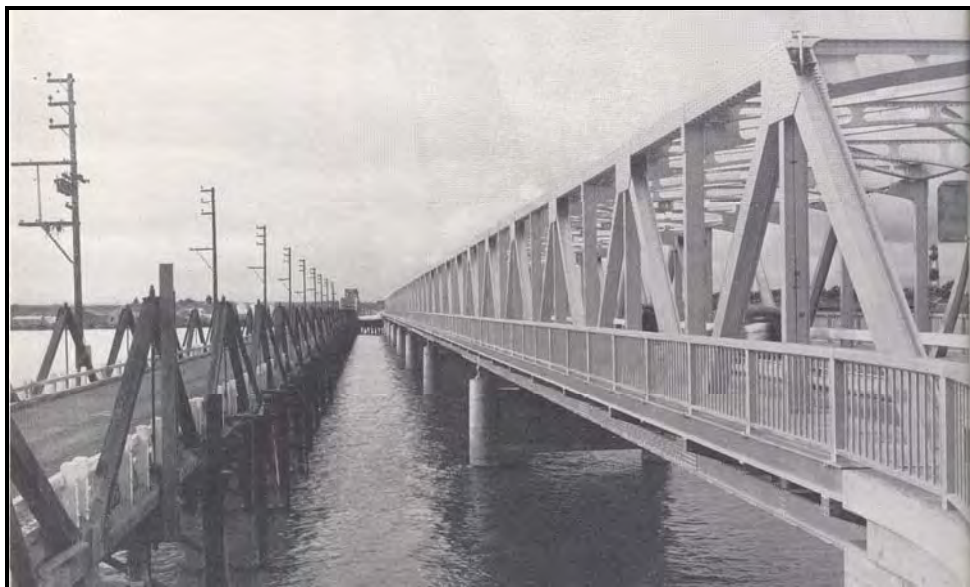
Photograph 2: Rio Vista Bridge on Sacramento River (23 0024) on right, replaced earlier timber structure. [ CH&PW , January 1946, 16.]