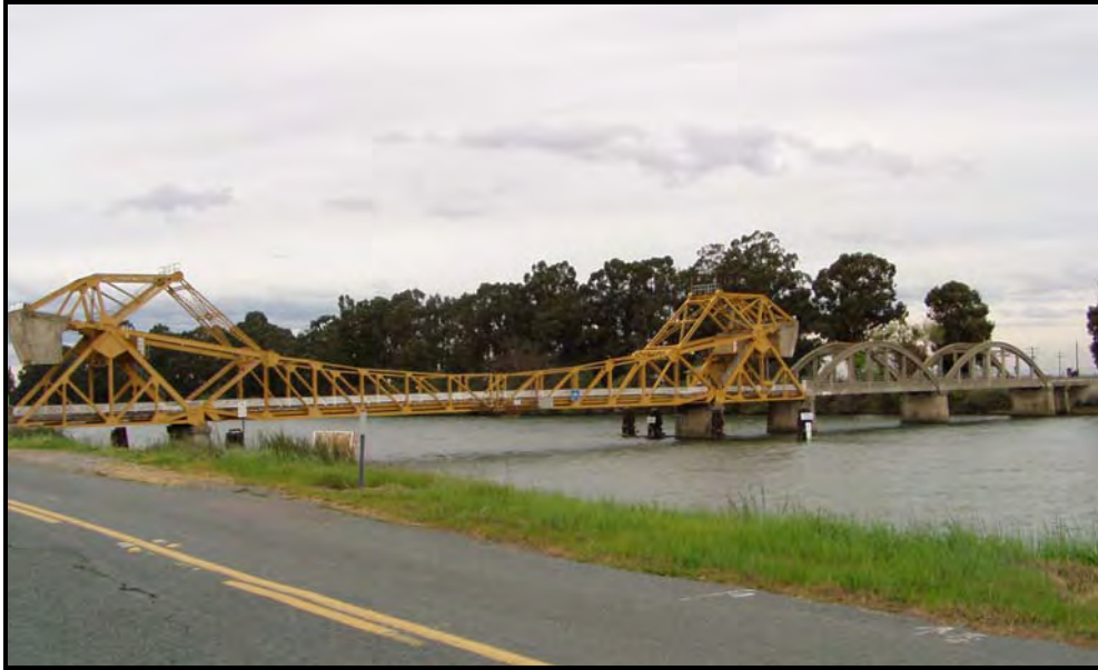
Photograph 16: Isleton Bridge, SR160 over the Sacramento River (24 0051), built 1923. March 2003.

Bascule design features concrete counterweights, such as those shown in Photograph 16 of the Isleton Bridge (24 0051) that reduced the power needed to lift the leaf, or movable span. Four trunnions ensure that the counterweights are balanced. 37