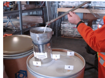
Figure 4. Combined the 5 (or More) Thieved Samples into One Composite Sample that is About ½ gal in Volume