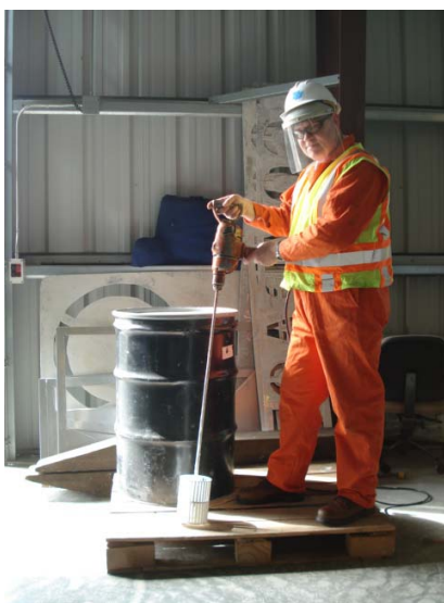
Figure 5. Appropriately-Sized, Powered, Mixing Equipment Must Be Used To Completely Mix the Traffic Paint For at Least 10 Minutes Before Sampling

After this mixing, check the container to ensure that the 'float water' and any pigment settlement has been homogeneously blended into the paint. If not thoroughly homogenized, probe the container to loosen any settlement and continue mixing. For drums, take a 1 qt sample from the vortex area while mixing the already blended paint. For totes, open the bottom outlet valve and let the initial 5 to 10 gal flow into a container before obtaining a 1 qt sample of the homogeneously blended paint from the bottom outlet. A short section of hose attached to the outlet coupler will make collection easier and cleaner.