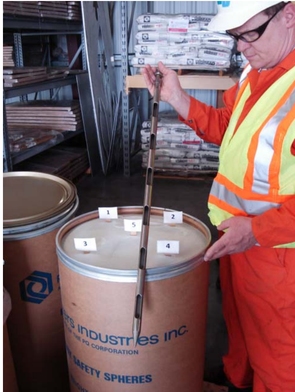
FIGURE 2. Use a Sample Thief to Take Glass Bead Samples from a Bulk Container