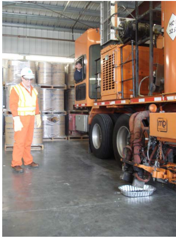
Figure 7. Sampling Molten Thermoplastic from the Applicator Gun