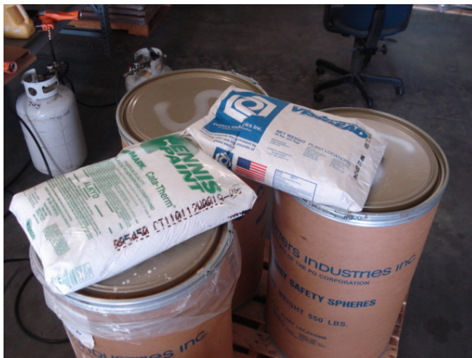
Figure 1. A Factory Sealed Bag Sample is Generally Preferred