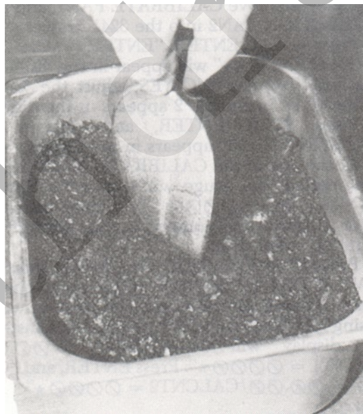
FIGURE 1. Loading Test Pan

End of Text (California Test 379 contains 11 pages)