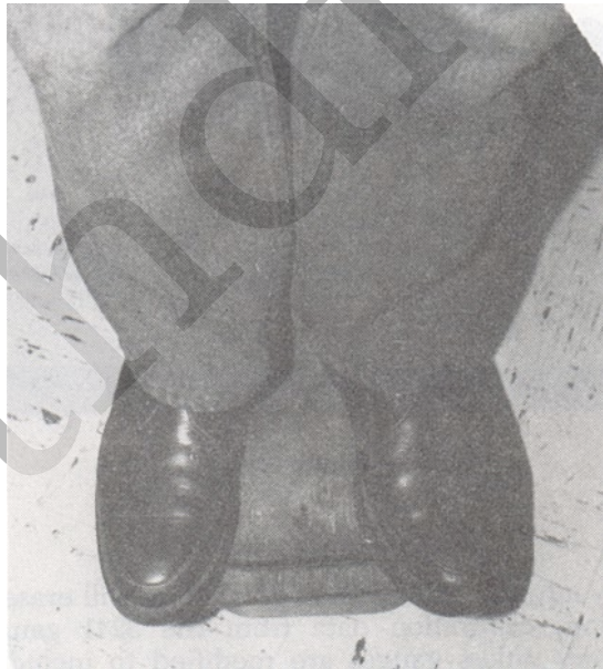
FIGURE 3. Standing on Pressing Board for Compaction