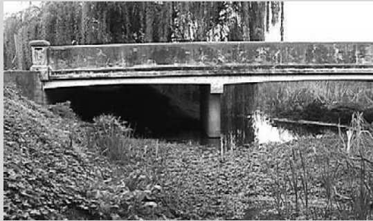
Fisher Creek, Santa Clara County